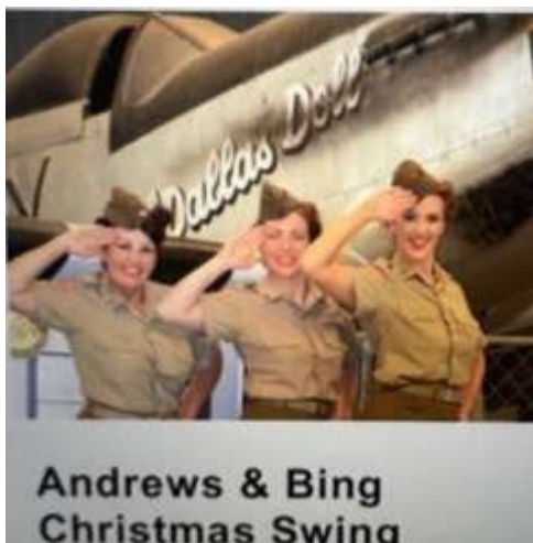
Andrews & Bing Christmas Swing