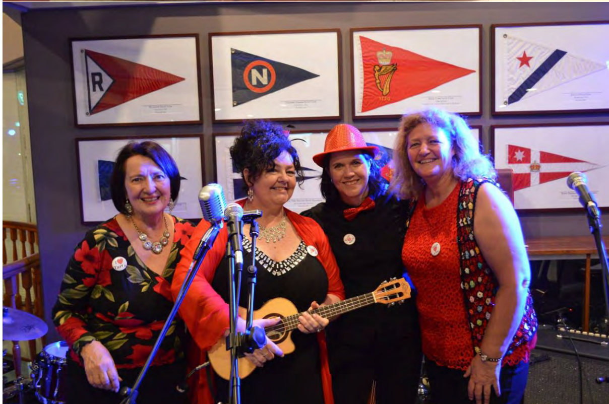
Upcoming Gigs- Thurs 2nd March function for Zonta International Womens Day at Redlands Sports Club. Tues 7th March The Bug (Brisbane Unplugged) @ New Farm Bowls Club and Sat 11th March International Womens Day High Tea for Redlands Centre for Women, Sheldon College Auditorium. Buy tix for the high tea event here http://www.redlandscentreforwomen.com/product/iwd-high-tea-2017/