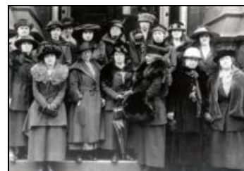
Delegates from the first Zonta Clubs met 8 November 1919, to found the Confederation of Zonta Clubs.

On the 8th November 2009 Zonta International celebrates its 90th Birthday