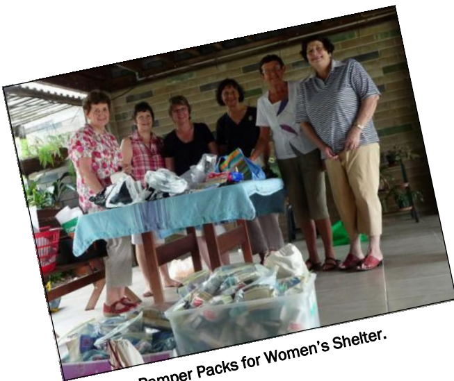
Pamper Packs for Women's Shelter.