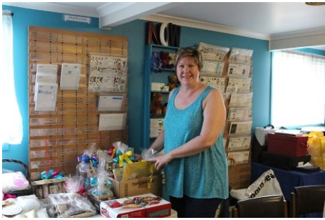
Cent Sale time!