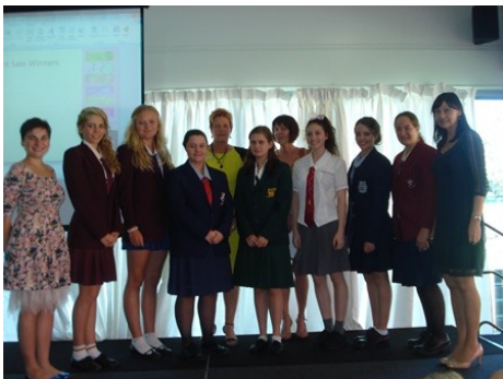
Finalists in the YWPA Award 2013.