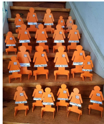
Matilda - Germany