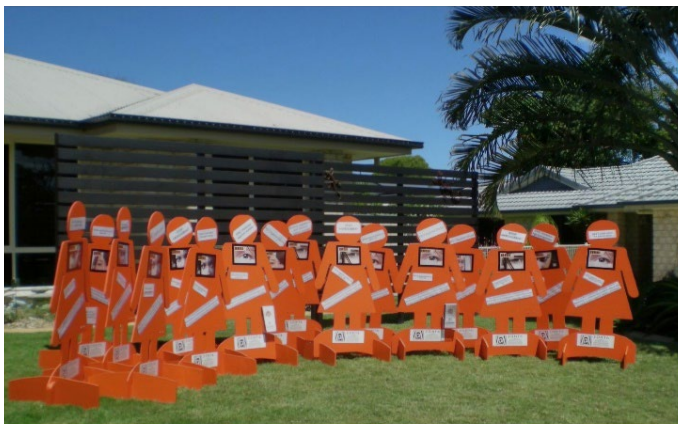
The Orange Lady - Australia