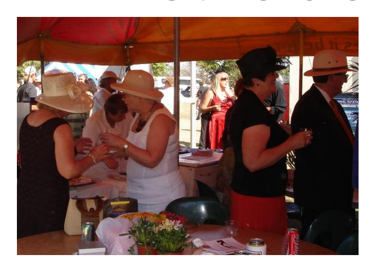
Zonta Club of Bowen's tent at the Bowen Cup race day held on the 10<sup>th</sup> October. (above & above right)