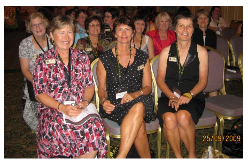
Members waiting for the Opening Ceremony to commence.