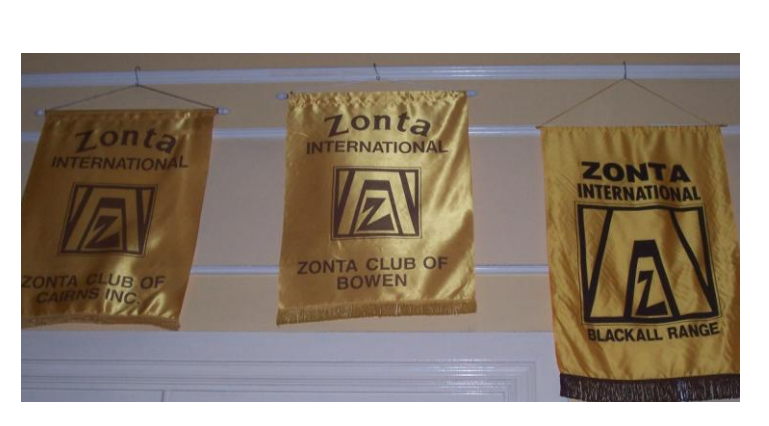
Zonta Club of Bowen's flag flying high.