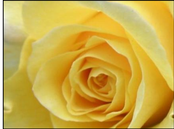
Since 1999, the Zonta Rose has served as the symbol of Zonta Rose Day, 8 March. On this day, Zontians are encouraged to publicly distribute yellow roses or items bearing the image of yellow roses, accompanied by information about Zonta International.