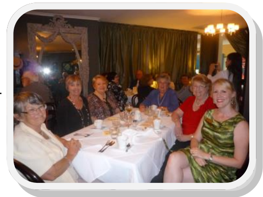
Area Meeting Rockhampton—2012—Formal Dinner.