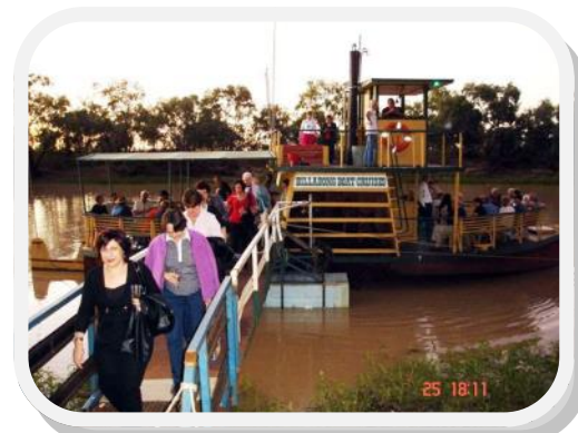
Area Meeting Longreach—2009—Cruise on the Thomson.

Zonta maintains a presence in countries marked in Gold.