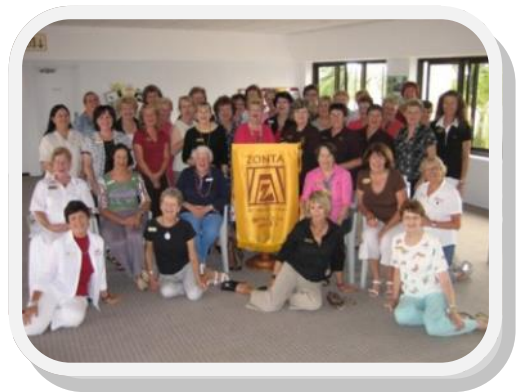
Area Meeting Hervey Bay—2007—Group photo.

For those Zontians who have not attended an Area Meeting, it is worth considering, as it is a time not only for expanding your knowledge of Zonta, but also for an opportunity to meet with Zontians from other clubs to enjoy the company of like minded women. The social activities which accompany the meeting are always very enjoyable. Bundaberg Club would love to welcome you to this year's Area Meeting at Bargara.