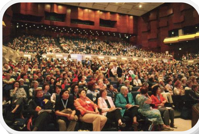
Zonta International Convention Rotterdam—2008

Zonta International seeks to advance the status of women worldwide by improving the legal, political, economic, educational, health and professional status of women at the global and local levels through service and advocacy. With the generosity and collective action of Zontians and friends around the world, Zonta International has supported projects in 56 countries, provided scholarships and awards to women around the globe, and been a powerful advocate for change in our local and international communities, thereby transforming the world and women's place in it.