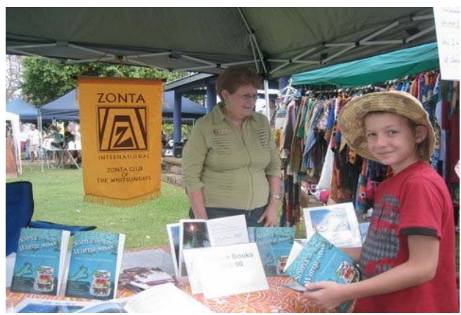
Airlie Beach Saturday Markets, with a discerning young lad buying a Zonta cookbook as a Christmas present for his mum