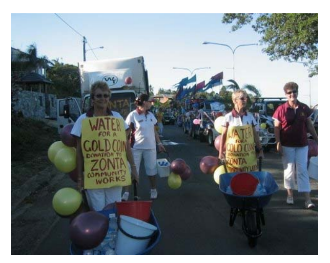
The Winning Team – Well done Girls! Don't you look professional in your new Zonta shirts!!