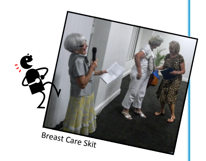
AFADU hard at work? Looks like fun too.