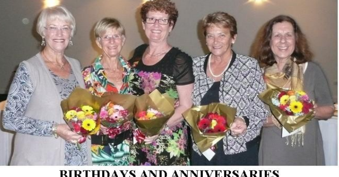
BIRTHDAYS AND ANNIVERSARIES