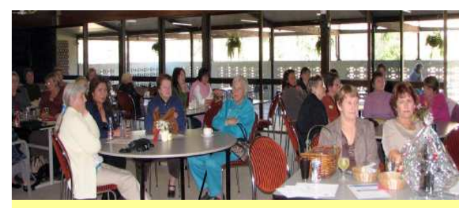
Participants at the Forum July 21st, 2007

With the support of the Status of Women Committee and a grant from the Office of Women, a few Collinsville ladies organised a successful informative and entertaining Saturday afternoon for women in their community. The Forum was well attended with over fifty women from eighteen to eighty years old. Proceeds were donated to the Royal Flying Doctor Service.