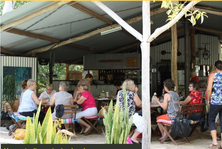
Above: Ladies enjoying lunch