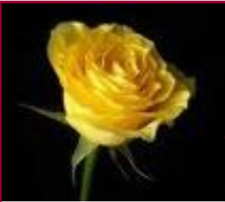
The yellow rose, Zonta's symbol