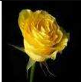
The Yellow rose the Zonta symbol