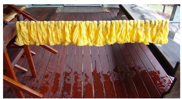
What is this all about? First correct answer wins free admission to the Rotary Boat Show

Talk on Breast Cancer by Eunice, very much from the heart