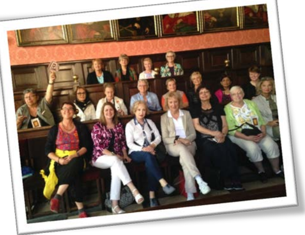
Pre-Convention tour around Poland organized by Zonta Club of Warsaw allowed for building relationships with Zontians