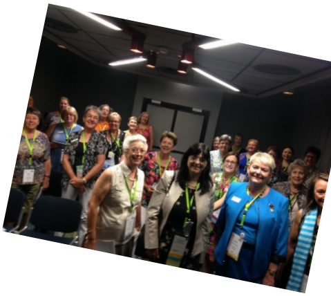
Australian contingent with Past & Present International Presidents, and D22 District Governors