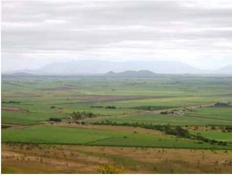
Looking towards Mt Kelly from Mt Inkerman