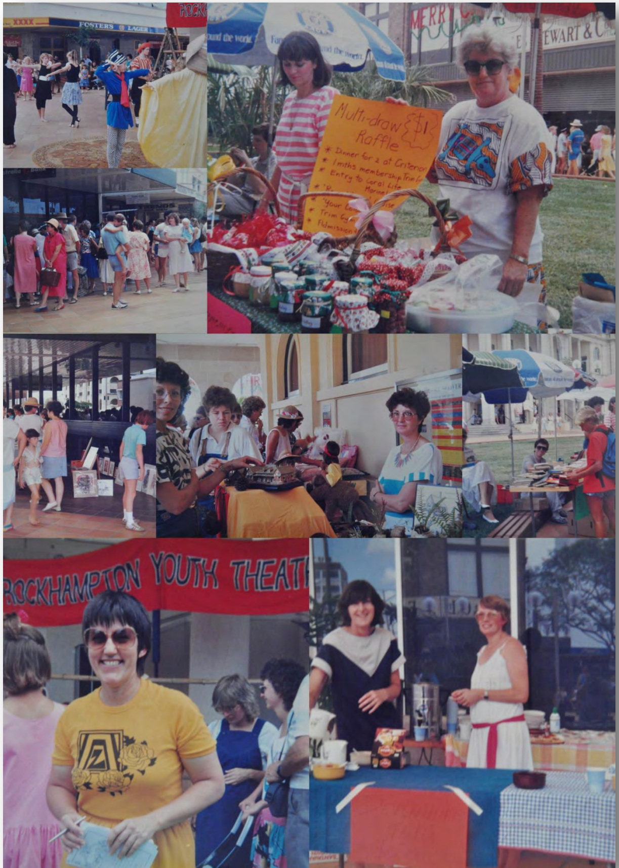
Zonta Craft Fair in City Heart Mall - 1987