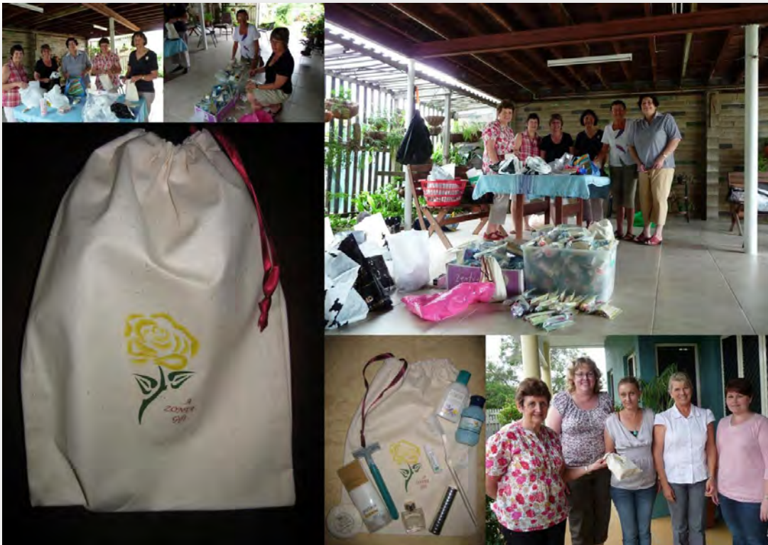
Pamper Packs for Women's Shelter 2002 to 2013

May 2003 – Pre Carnival High Tea – raised $1196.55