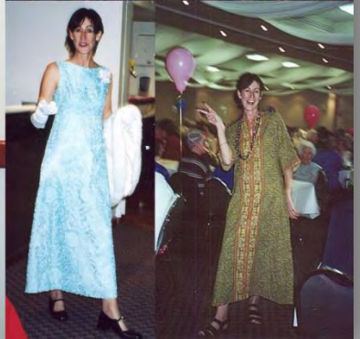
"A walk down memory lane" – Afternoon Tea and Fashion Parade - 2001