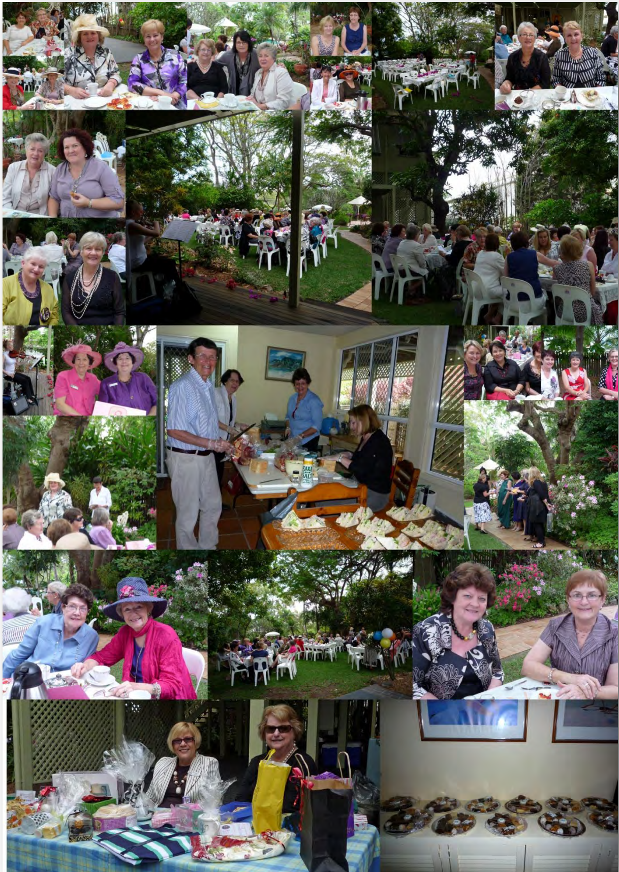
Garden Party – Fashion Parade & Musical Entertainment - 2010