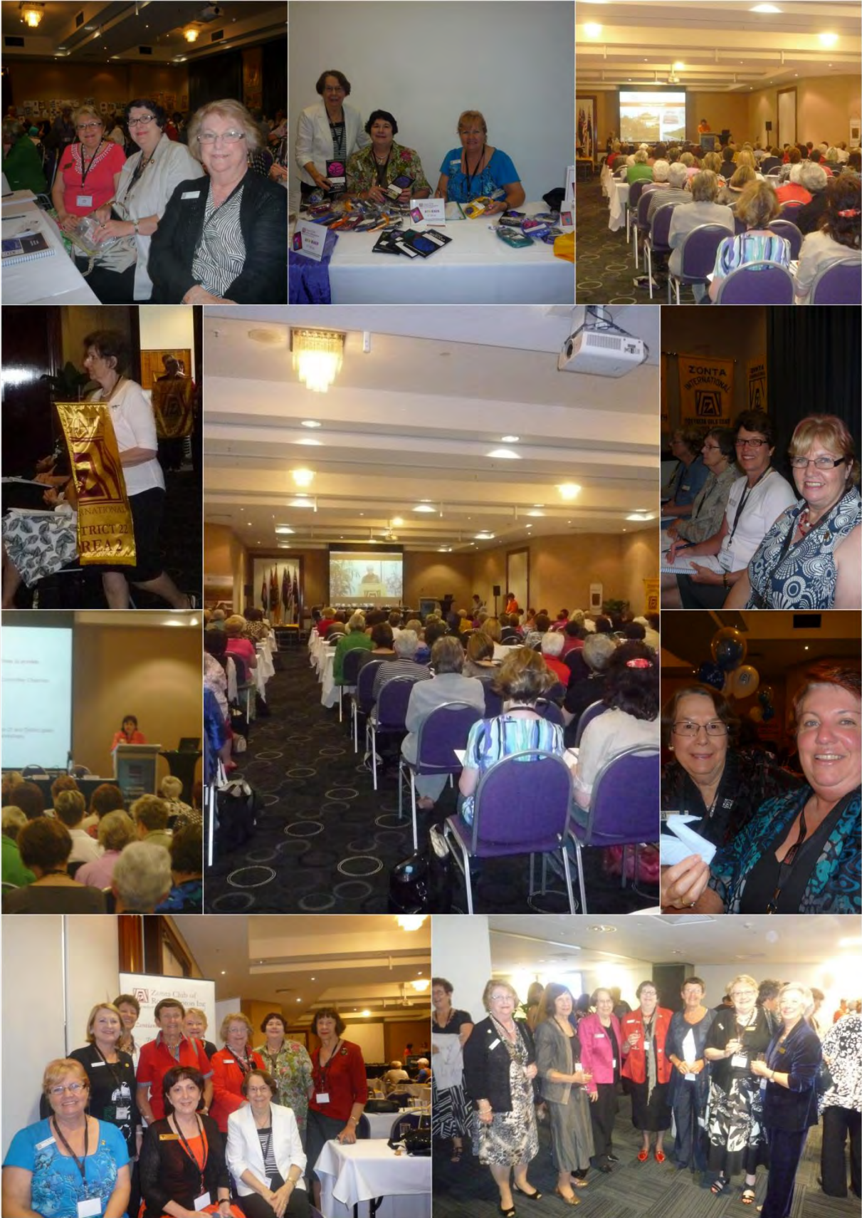
District 22 Conference – Brisbane – September 2011