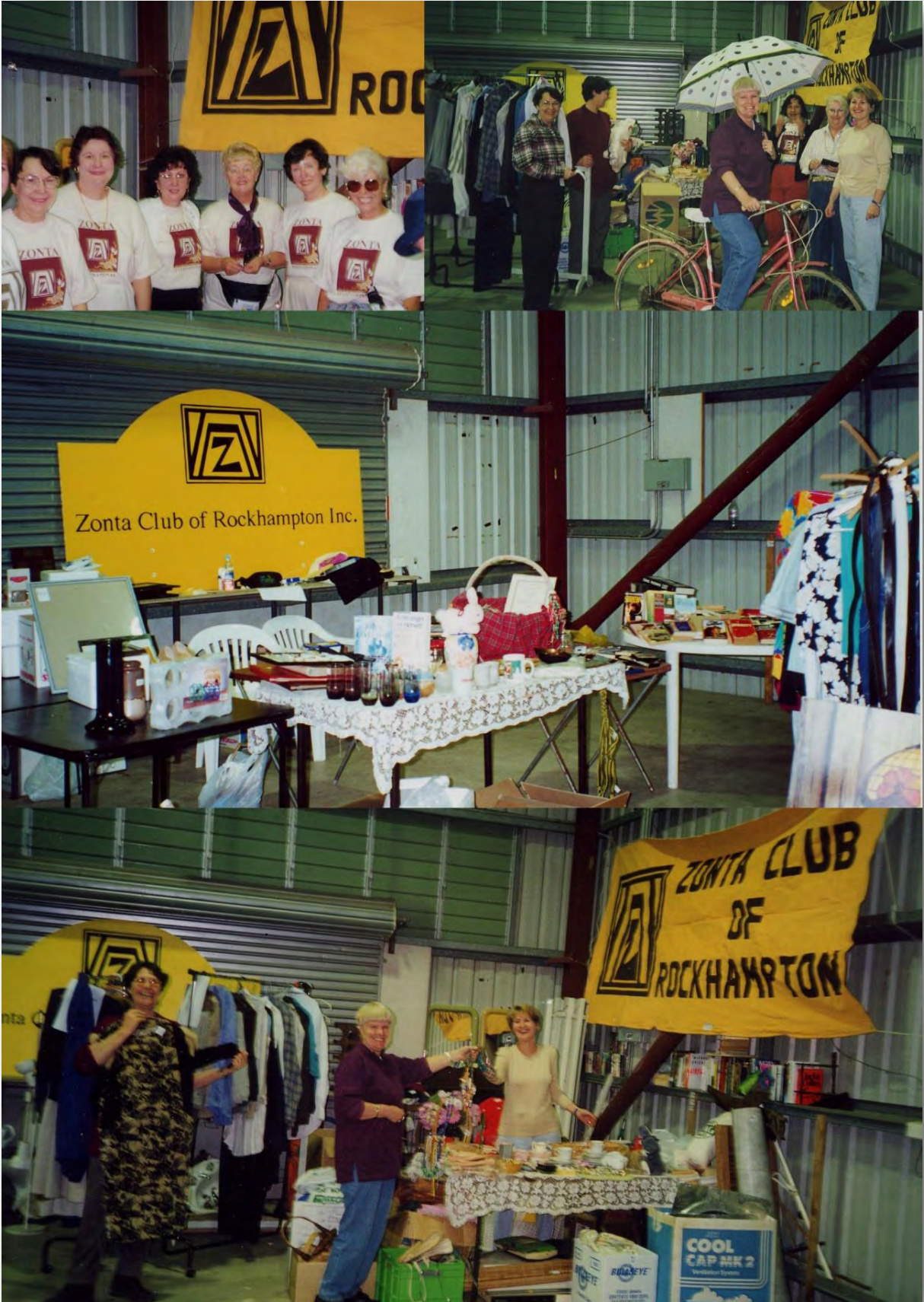
Fundraising at Rotary Swap - 2000