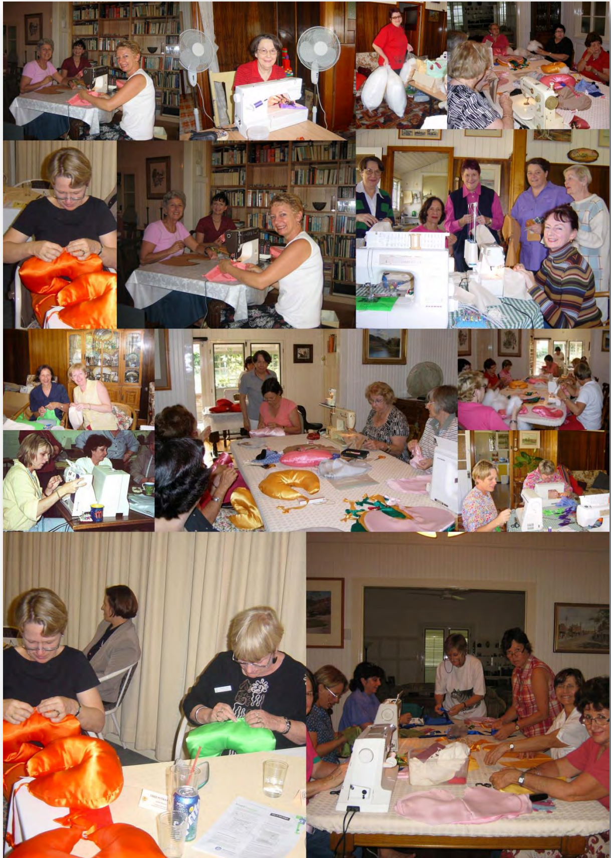
Breast Care Cushion Project – support for breast surgery patients 2001 to 2013