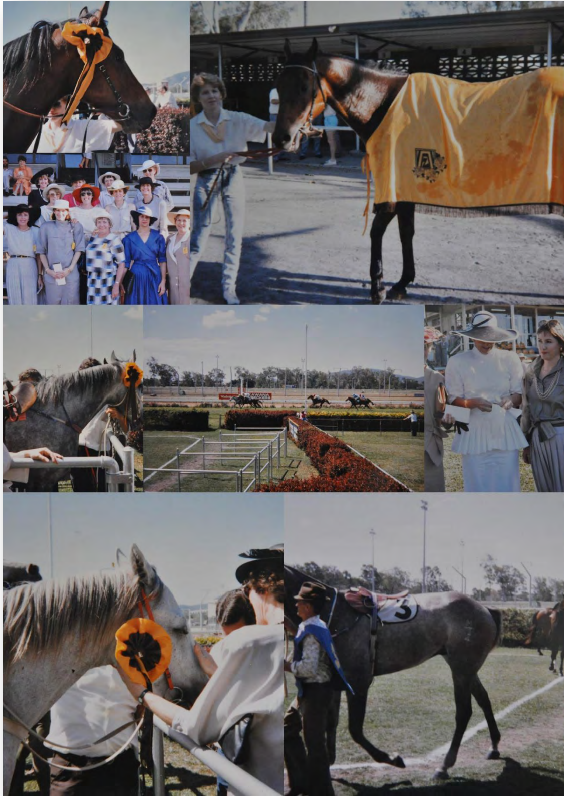
Zonta Spring Race Day - 1989

1991 – Rockhampton Zonta Club donated $500 to the Rockhampton Flood Appeal with other Zonta Clubs in District donating a total of $7000 and Australia wide $10,000. Funds distributed to flood affected areas, mainly Depot Hill which was under water for 4 weeks.