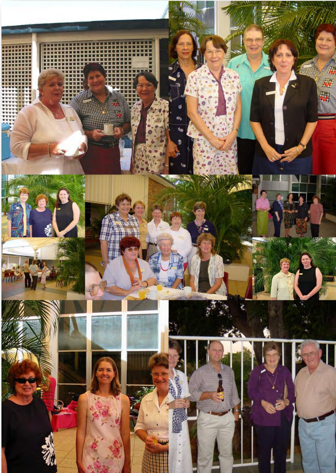
Area 4 Meeting 2002 - Longreach