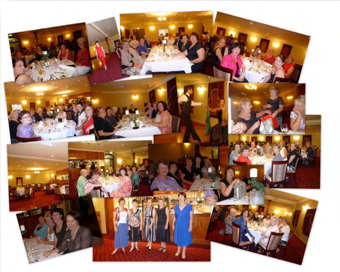
Evening in Vienna – Fashion Parade and Ballroom Dancing Display - 2009