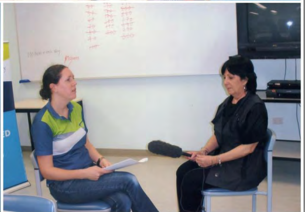
Supporting the Birthing Kit Project