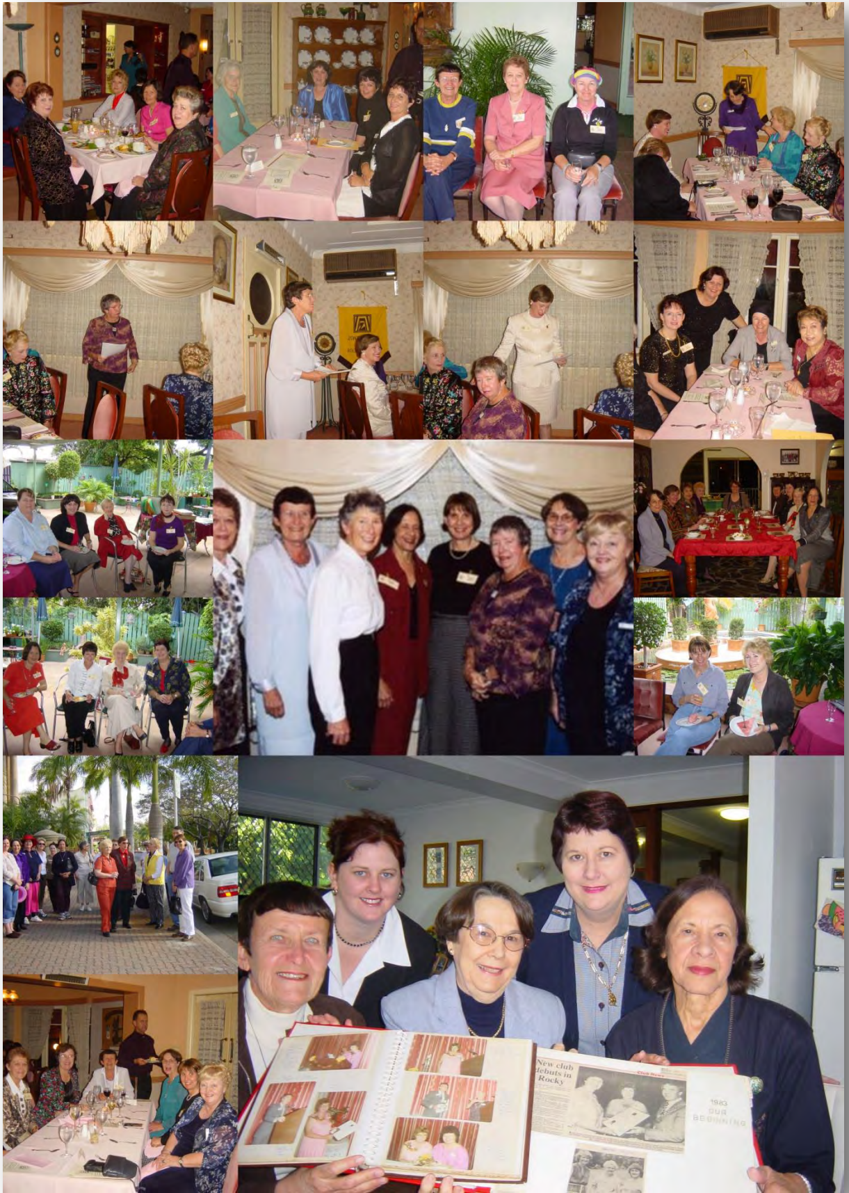
Celebrating 20 years of Zonta service to Rockhampton August 2003