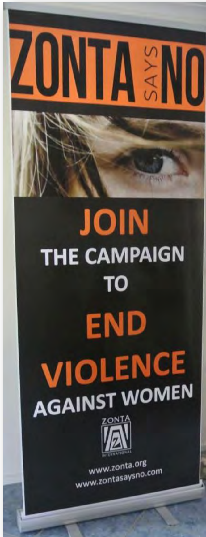
Zonta Says NO Banner