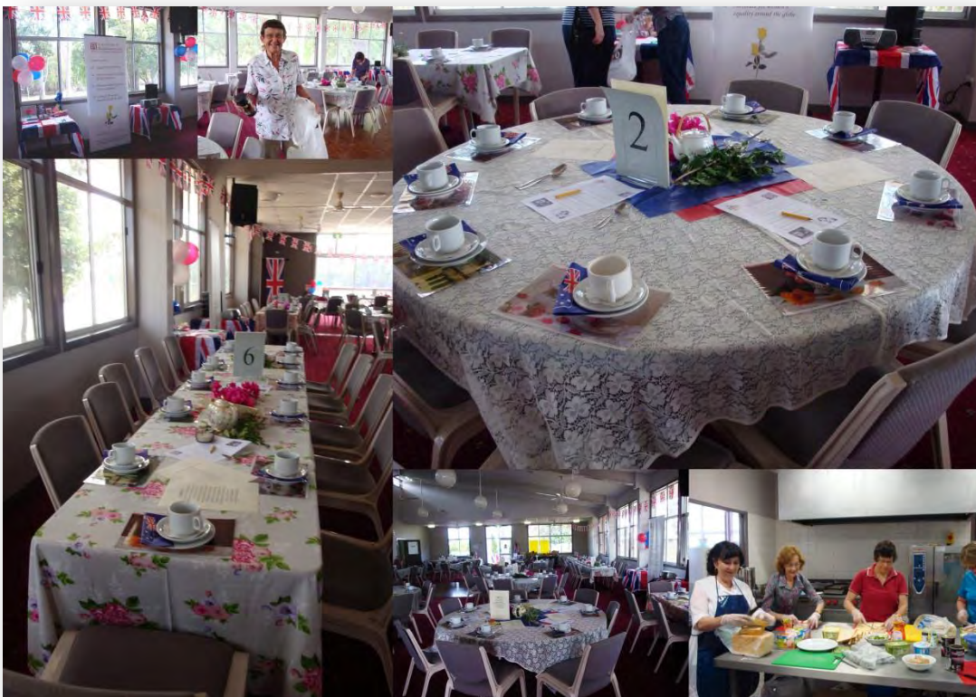
Jubilee Afternoon Tea – August 2012