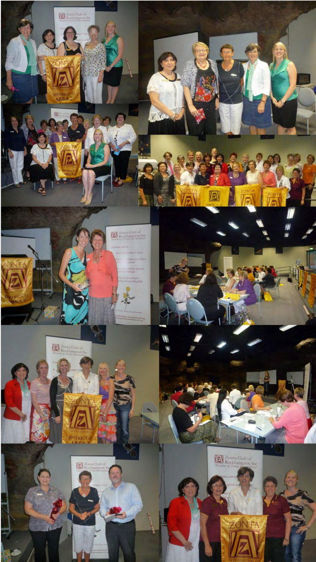
Area 2 Meeting – Rockhampton – April 2012