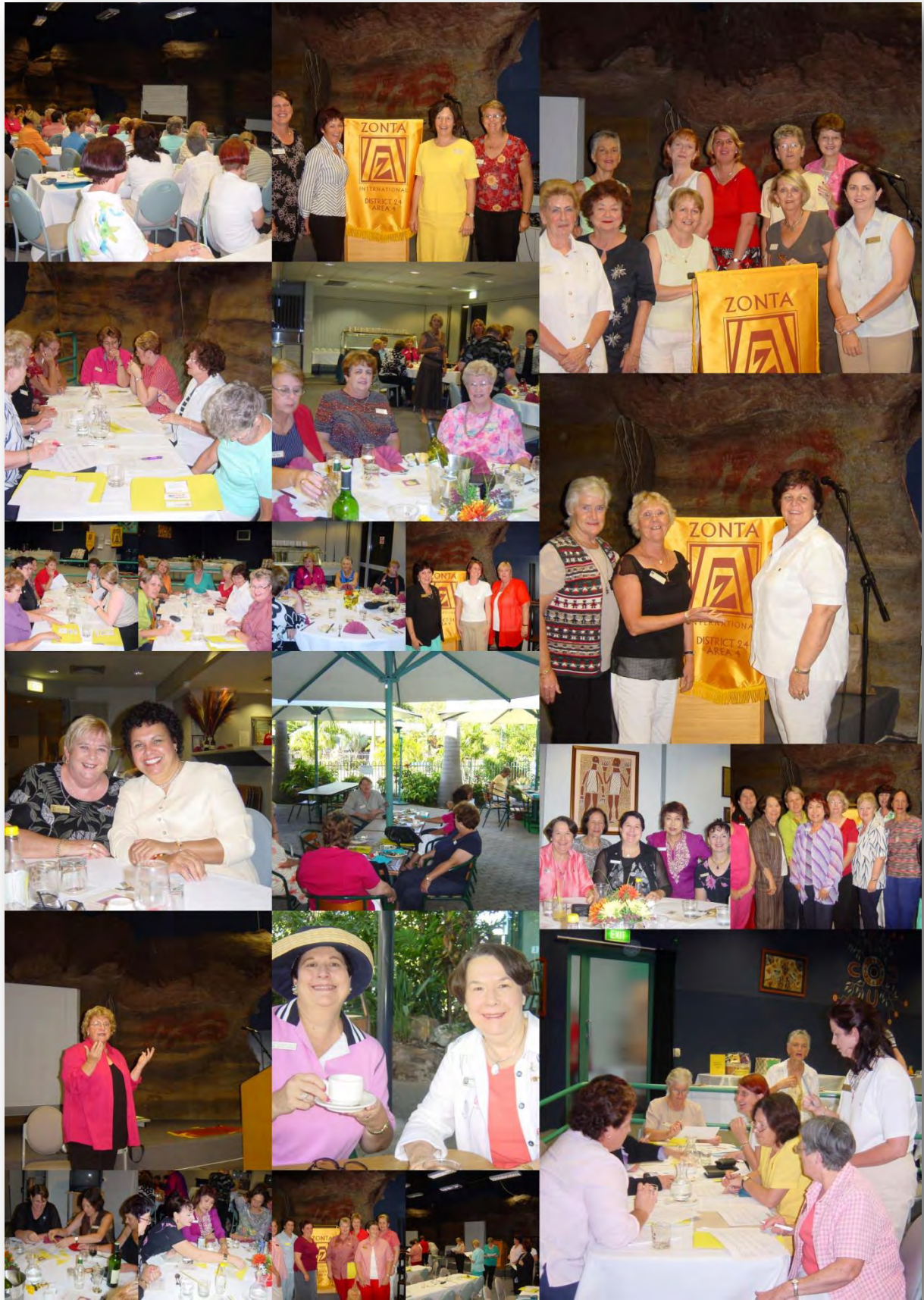
Area 4 Meeting 2005 - Rockhampton