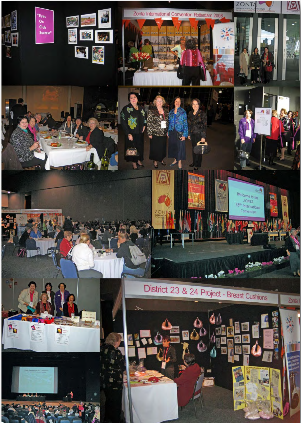
Zonta International Convention – Melbourne - June 2006