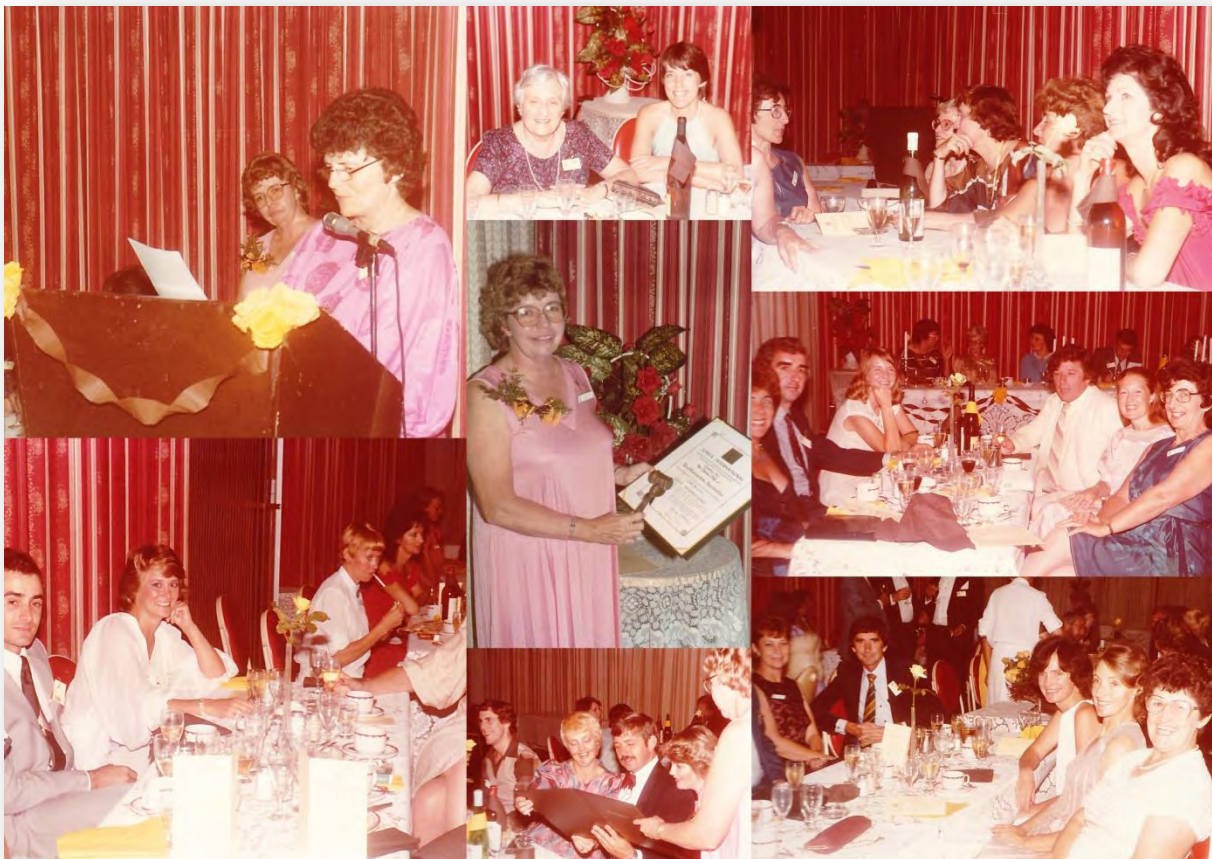
Charter Dinner – 19 th November 1983.