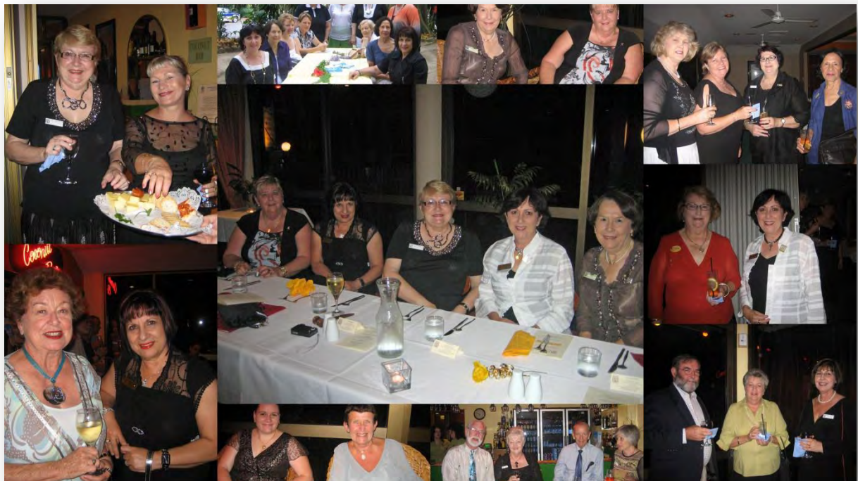
Celebrating 25 years of Zonta Club of Rockhampton Inc. - 2008

May 2009 – Sale of Eco Bags for June 08 to May 09 - $1,569.88