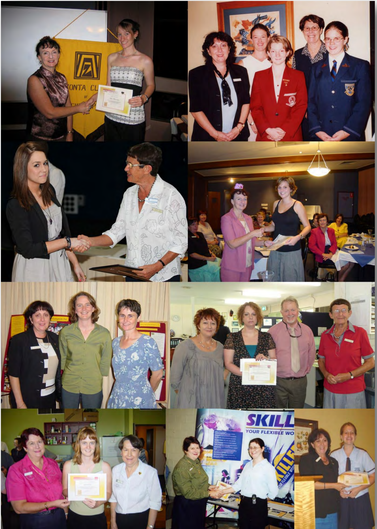
Zonta YWPA Awards and Education Awards 1985-2013