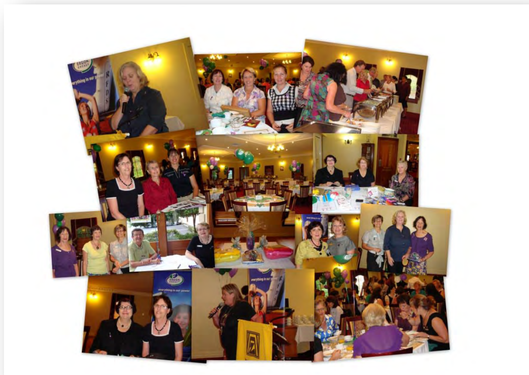
International Women’s Day Breakfast - 2010