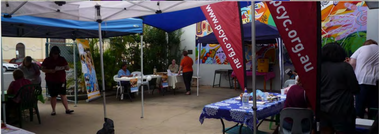
Women's Health Expo - 2010