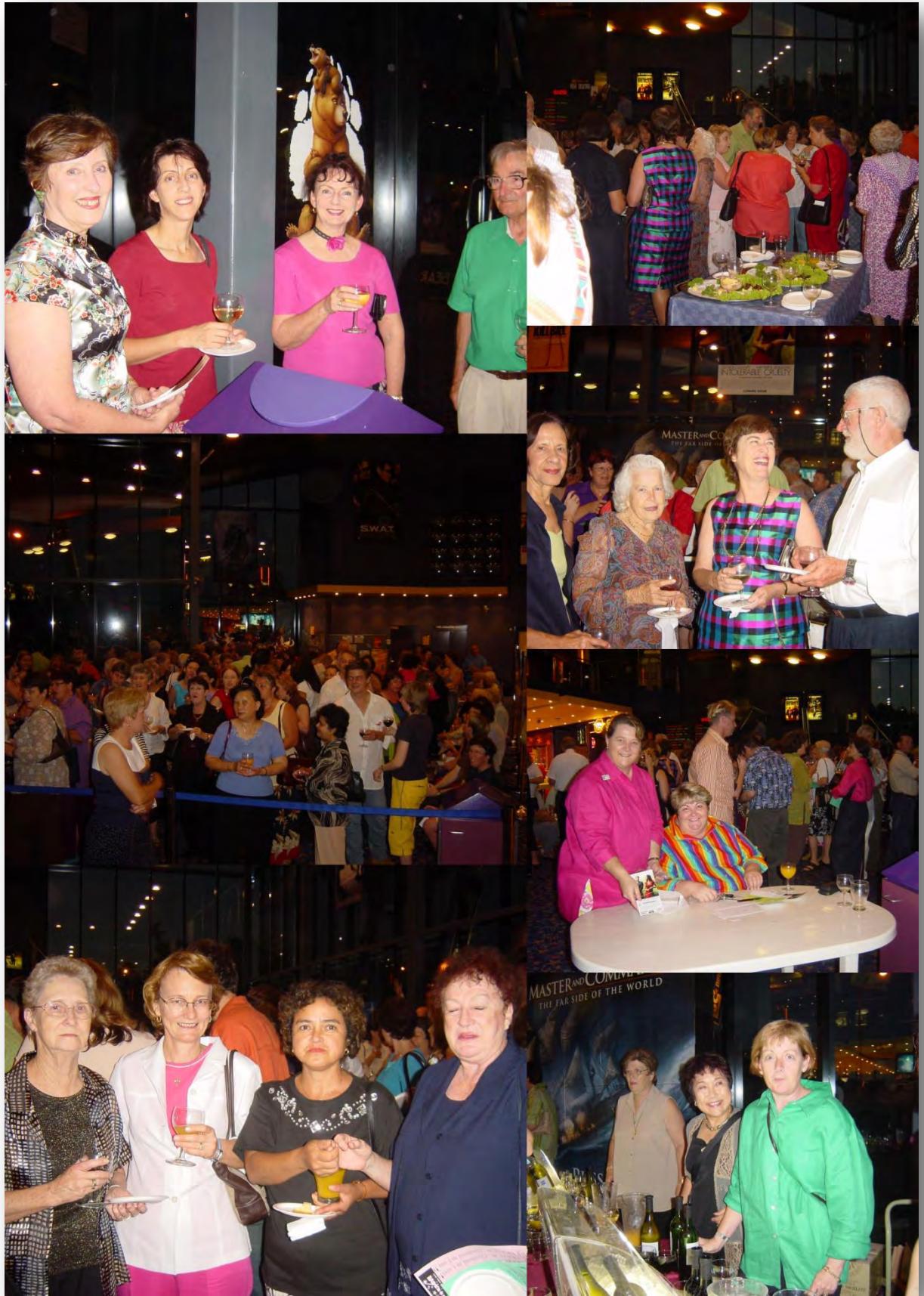
Movie Premiere - 2002