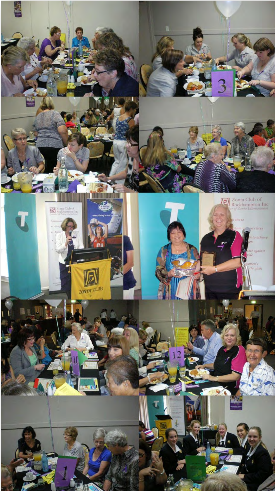
International Women's Day Breakfast - 2012