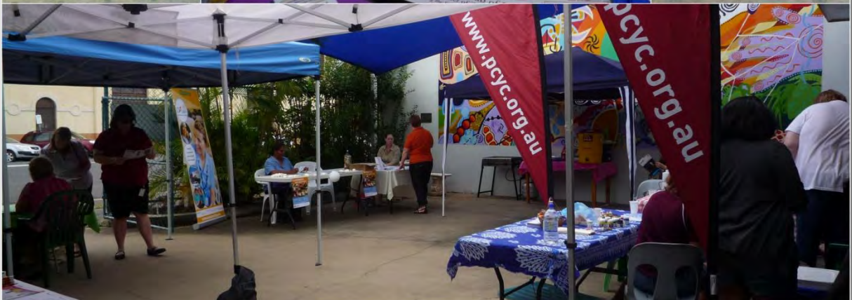
Women's Health Expo - 2010