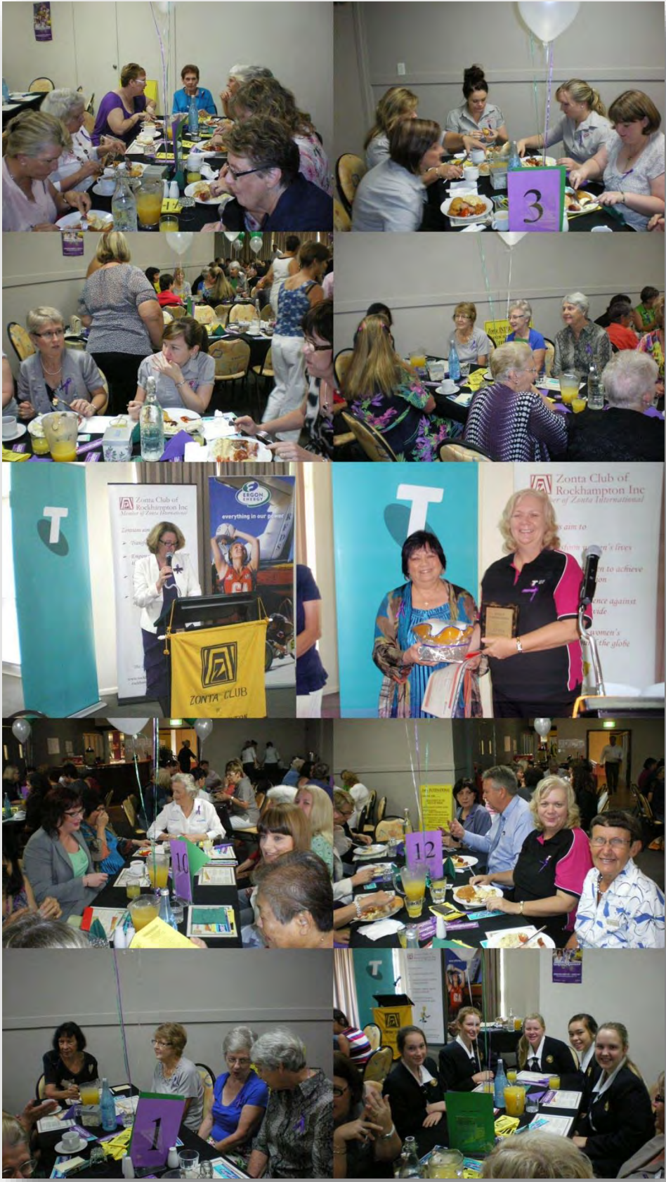
International Women's Day Breakfast - 2012