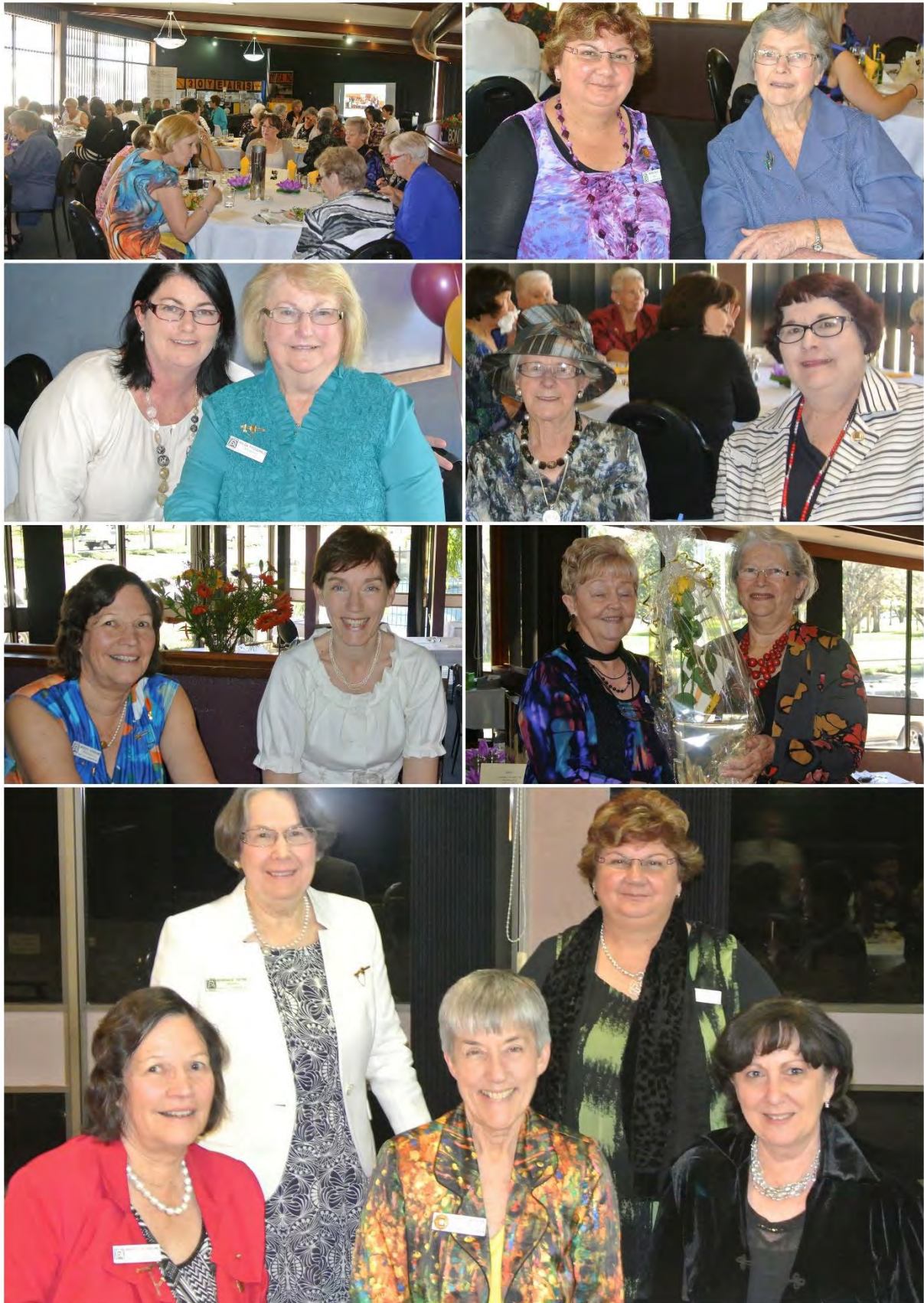
30 Year Anniversary Celebration – July 2013