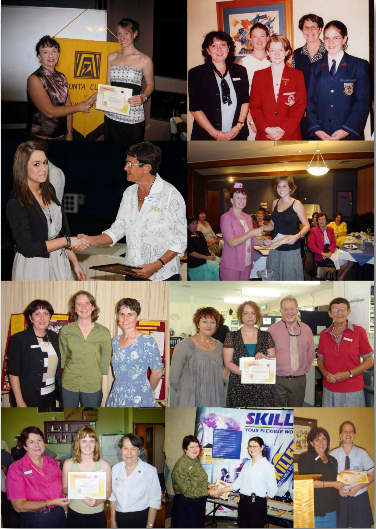
Zonta YWPA Awards and Education Awards 1985-2013