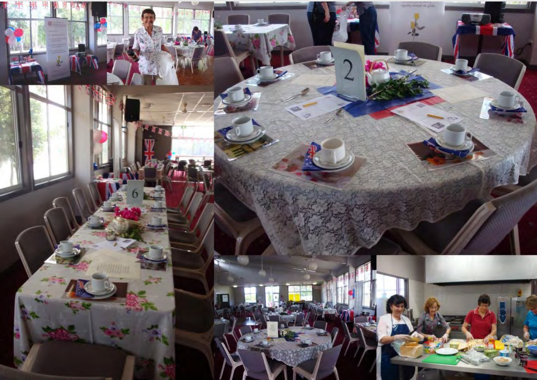
Jubilee Afternoon Tea – August 2012