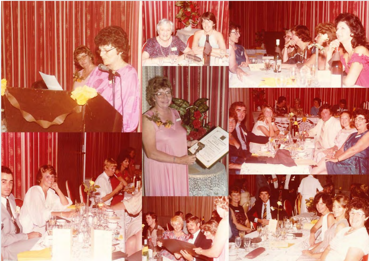
Charter Dinner – 19 th November 1983.