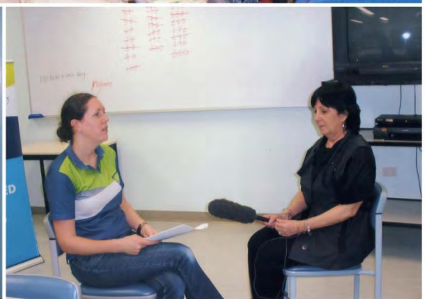
Supporting the Birthing Kit Project