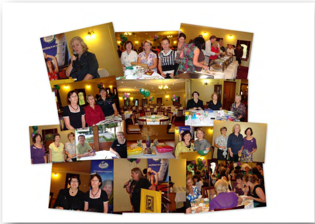
International Women's Day Breakfast - 2010