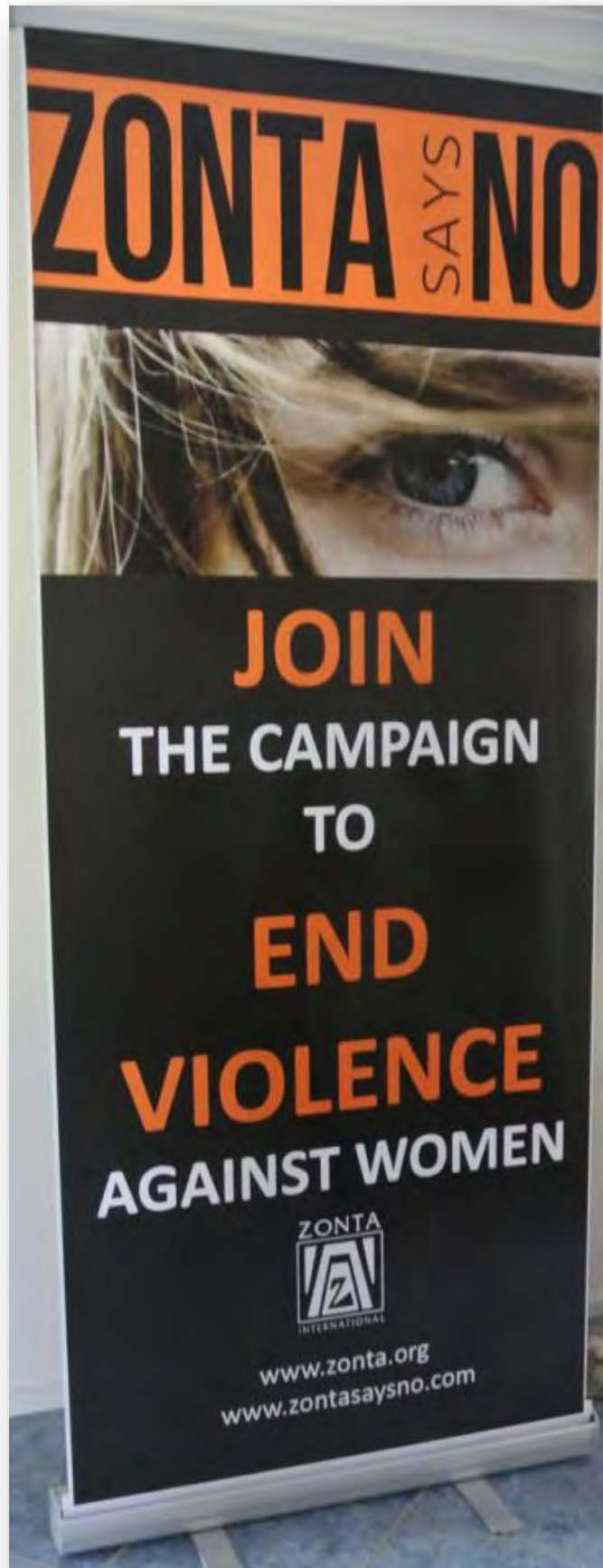
Zonta Says NO Banner