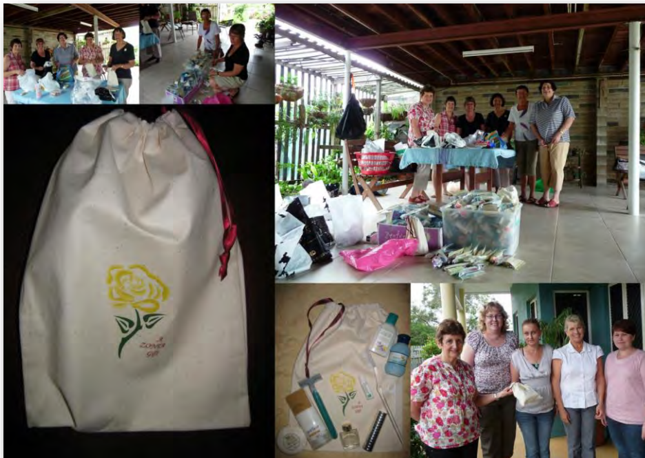
Pamper Packs for Women's Shelter 2002 to 2013

May 2003 – Pre Carnival High Tea – raised $1196.55