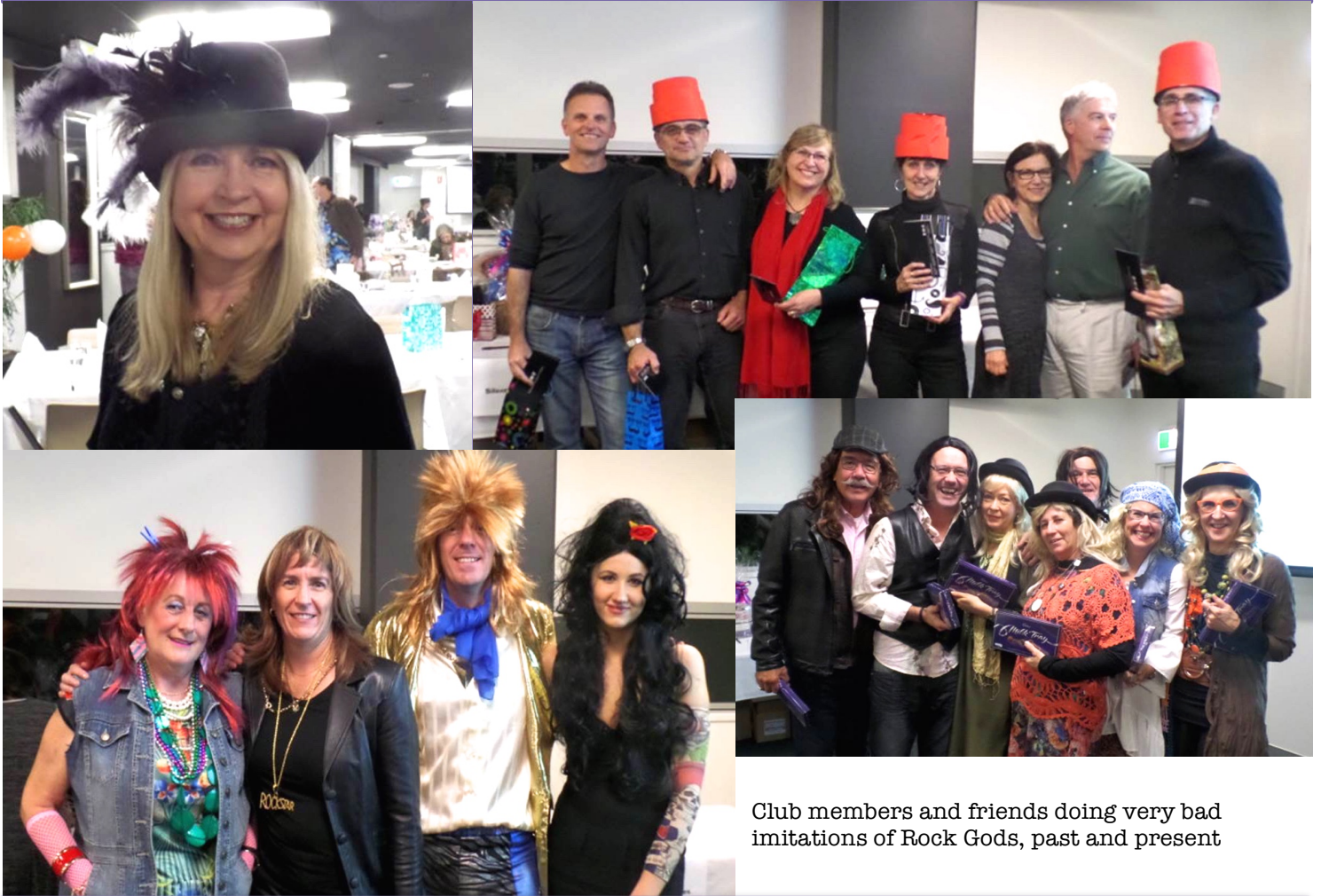
Club members and friends doing very bad imitations of Rock Gods, past and present

Our Annual Trivia Night was held on Friday, 3 July at 66 on Ernest’s Function Room at Southbank Institute of Technology.