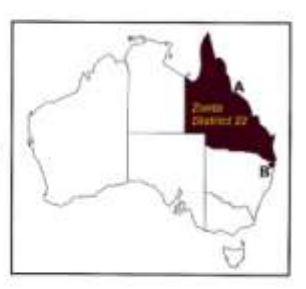
'advancing the status of women worldwide through service and advocacy'

A Queensland Australia B Northern Rivers Inc. New South Wales Australia