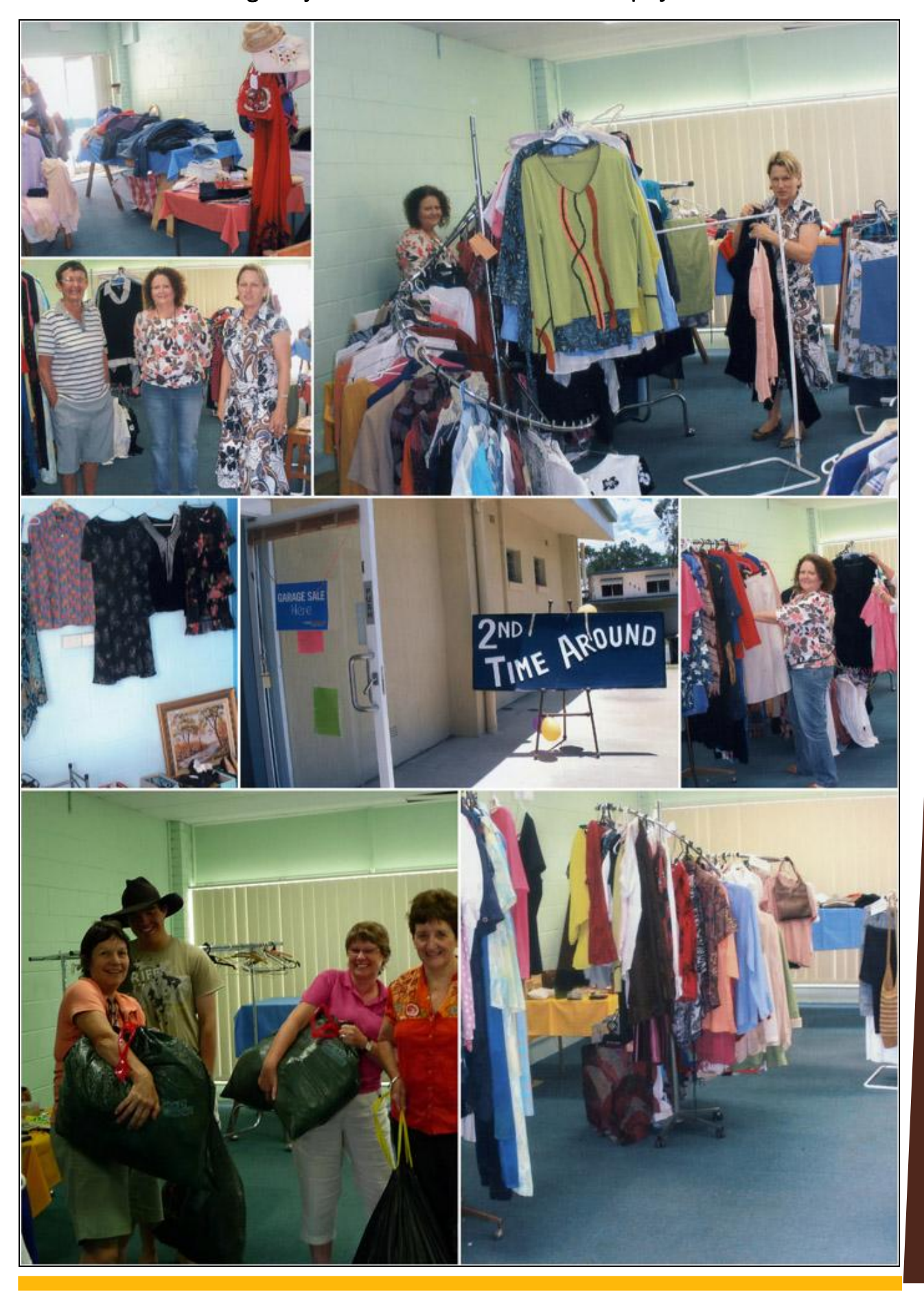
'advancing the status of women worldwide through service and advocacy'