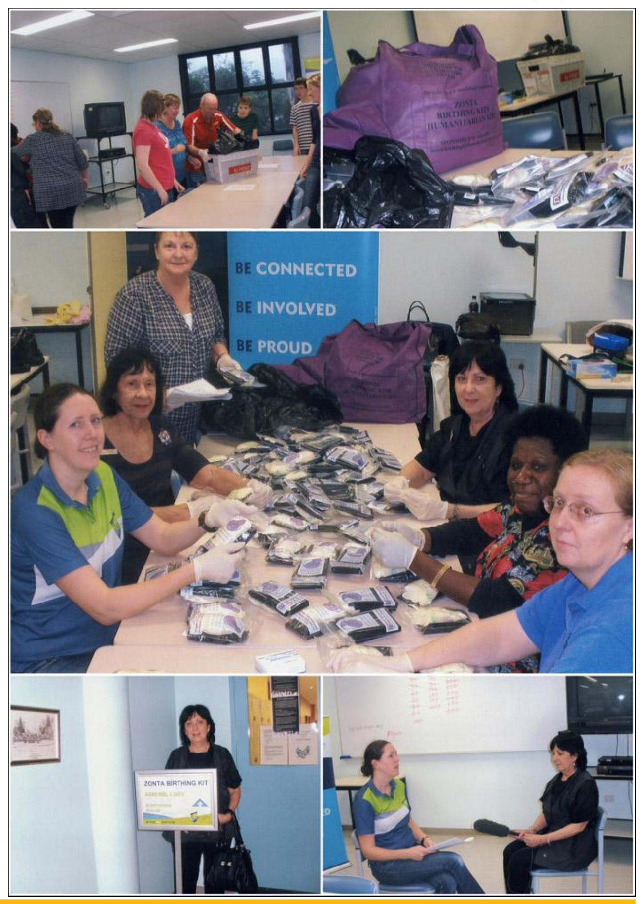
'advancing the status of women worldwide through service and advocacy'

In a joint project with Zonta International, CQUniversity campuses hosted volunteers who assembled thousands of birthing kits destined for remote villages in Papua New Guinea. Members of the Zonta Club of Rockhampton took part in the assembly day.