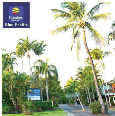
Comfort Resort Blue Pacific is a beachfront resort, situated on Mackay's beautiful Northern Beaches.

Did you know the Mackay region has over 30 beaches within 5 to 45 minutes drive of Mackay City Centre?