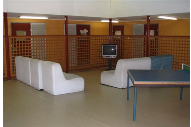
Inside the BYDC