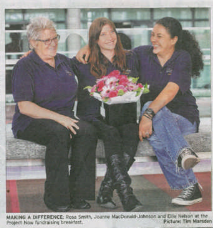
The Project NOW breakfast made the news.