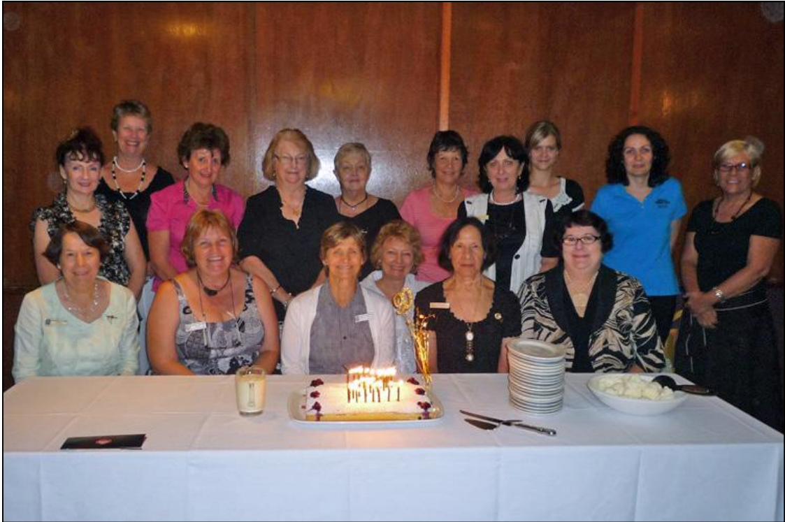
The November Dinner Meeting was an opportunity to celebrate Zonta International's 90th Birthday.