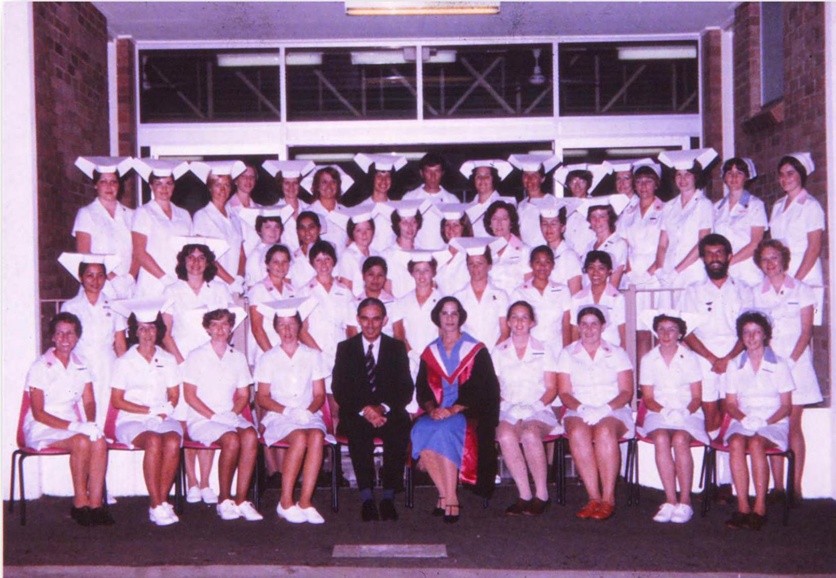
Graduation Class 1977