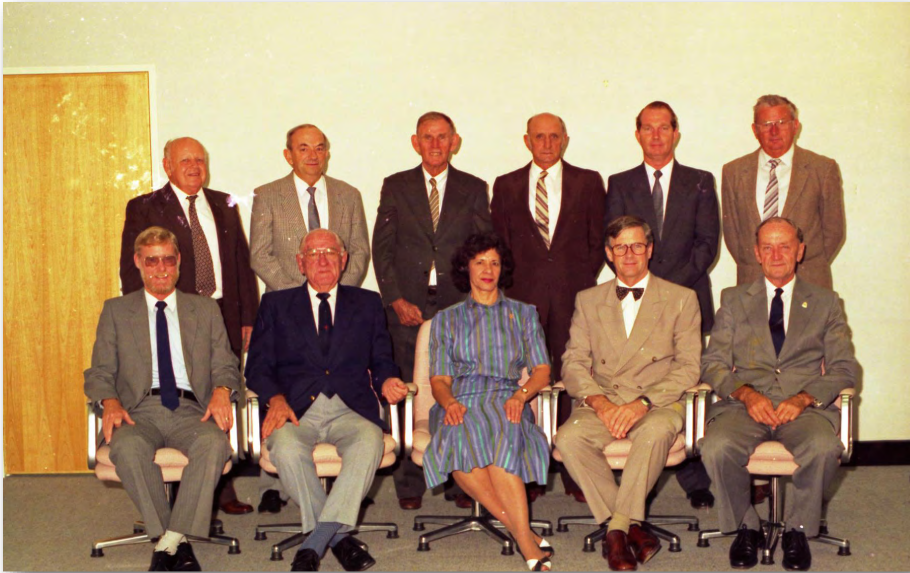
Rockhampton Hospitals Board 01 October 1996