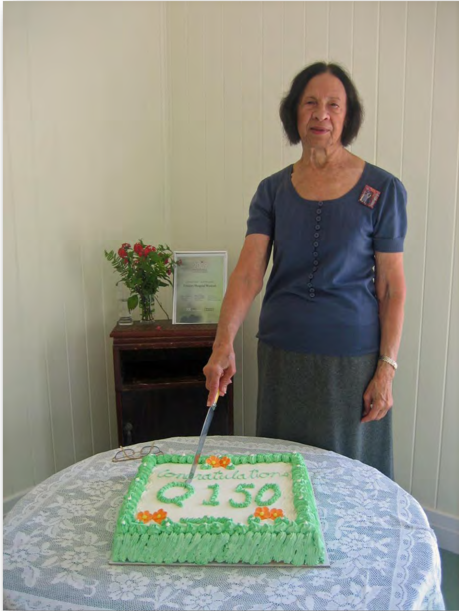
Q150 Celebrations at the Country Hospital Museum 27 June 2009