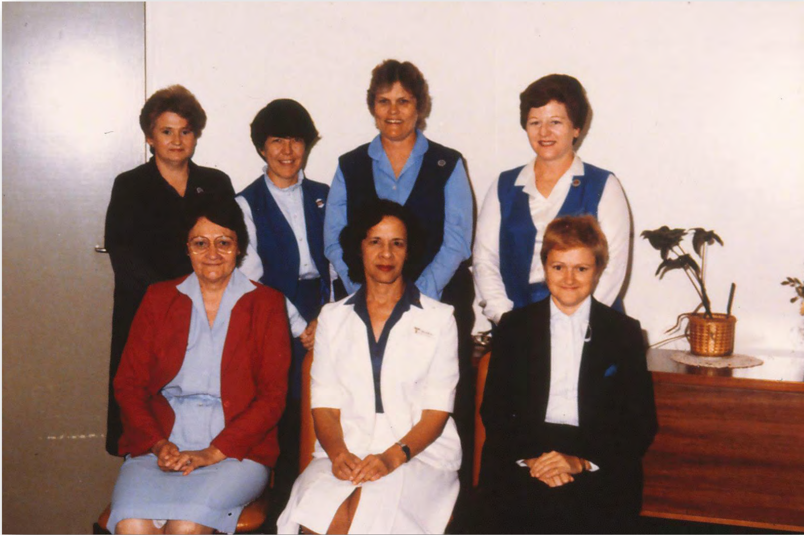
Nursing Administration Team ca. 1990