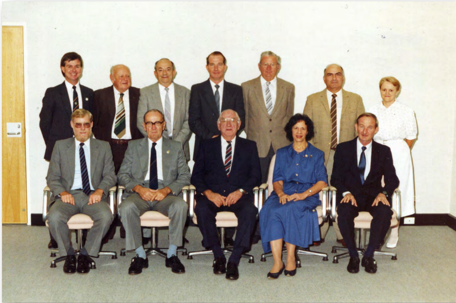
Rockhampton Hospitals Board 1991