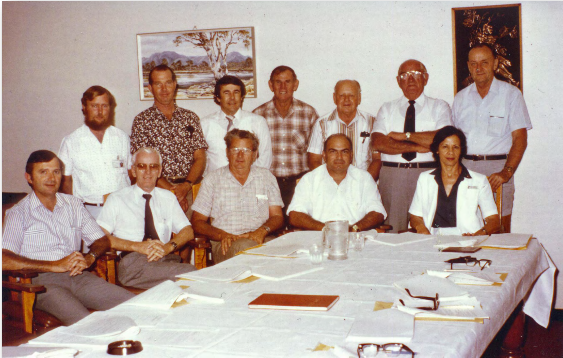
Rockhampton Hospitals Board 1983