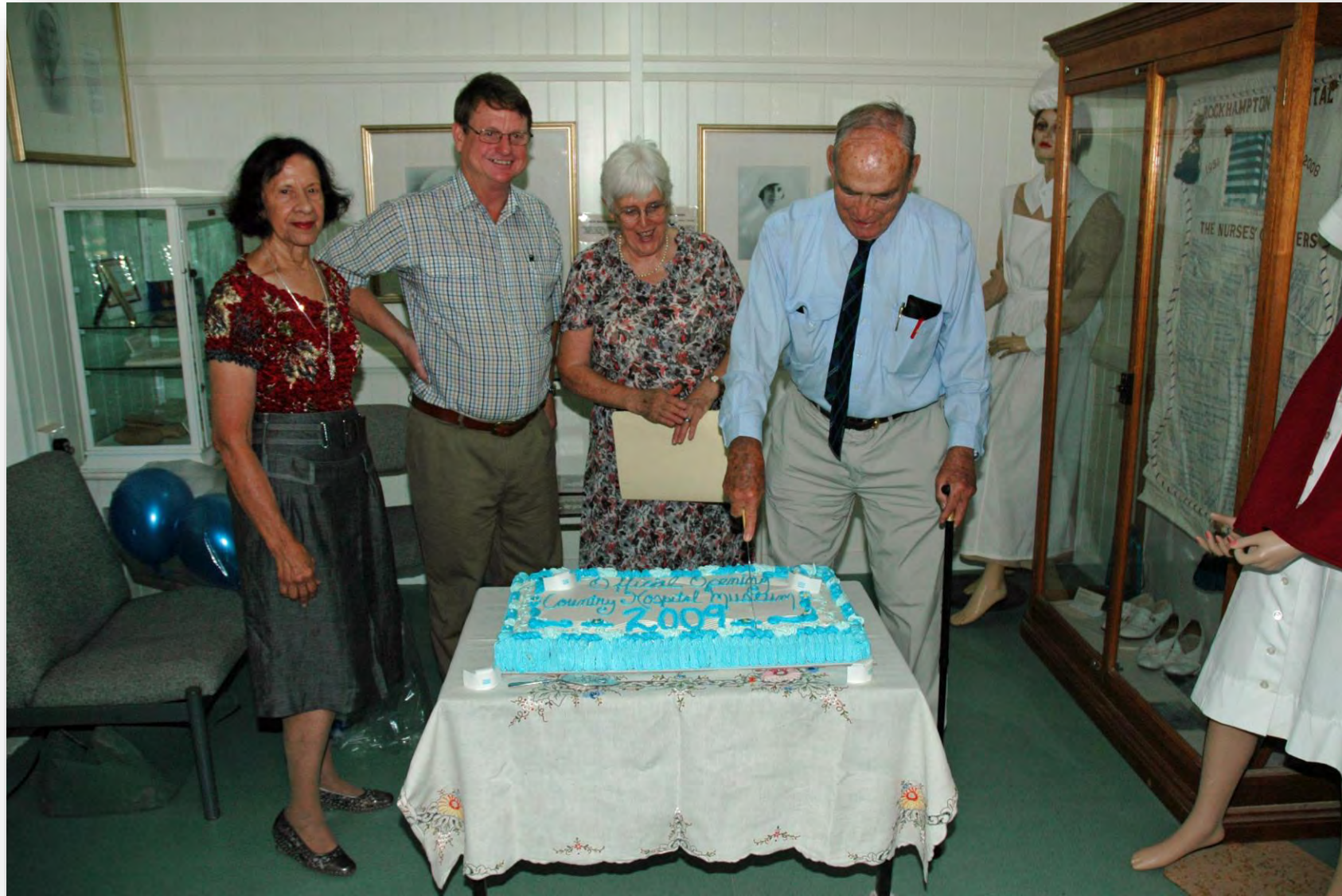
Official Opening of the Country Hospital Museum 21 st November 2009