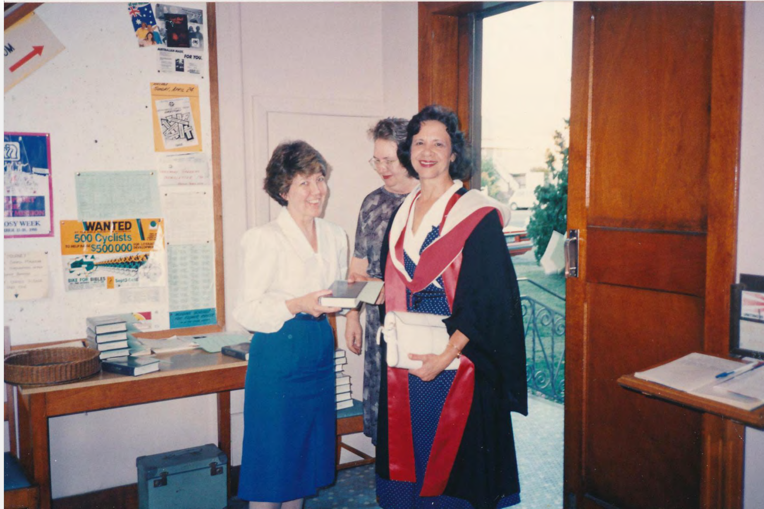
International Nurses Day 1988