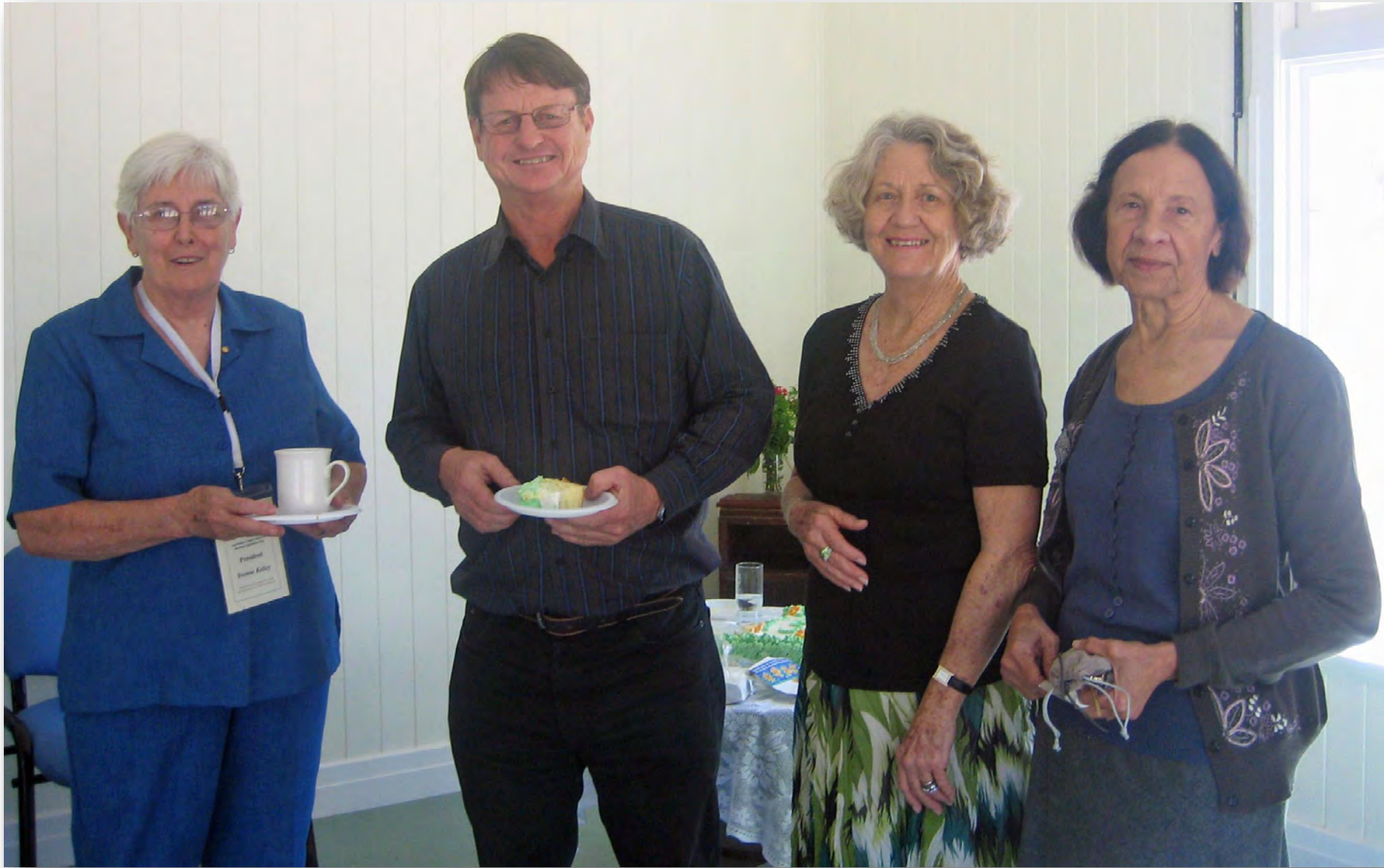
Celebrating Q150 at the museum 2009