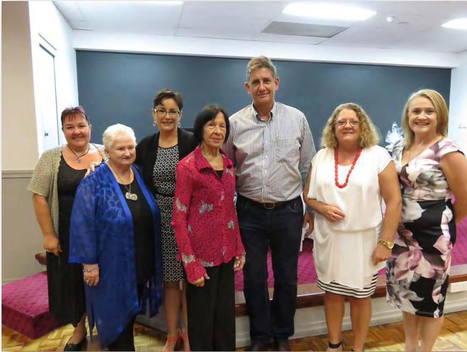
International Nurses Day 2016