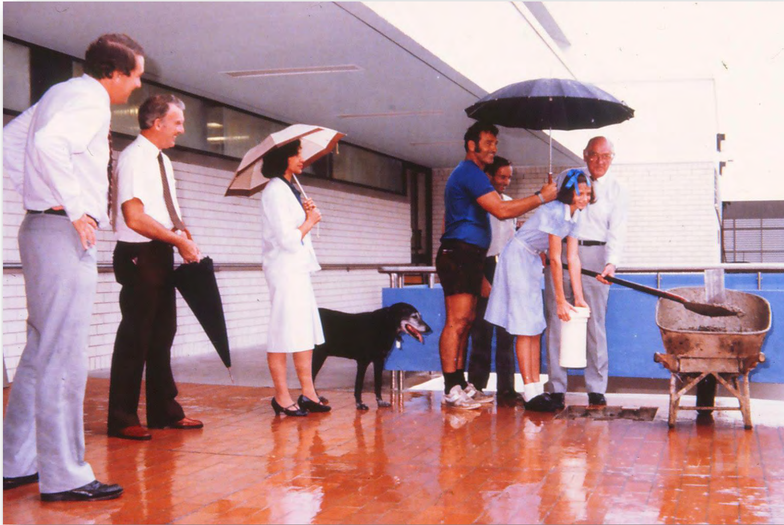
Placing Time Capsule during the opening of the Medical Services Building 1986