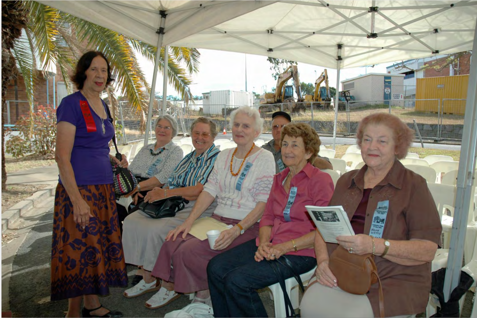
Nurses Quarters Wake 25 th May 2008