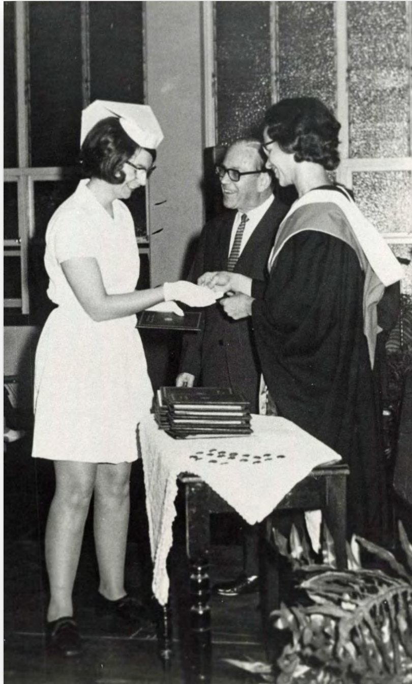
Graduation Ceremony 1971