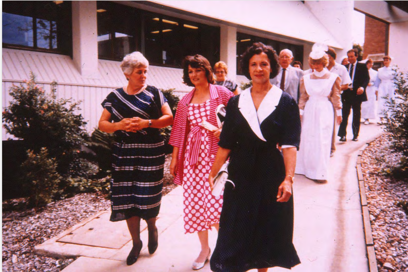
Opening of the Base Hospital Museum 1988