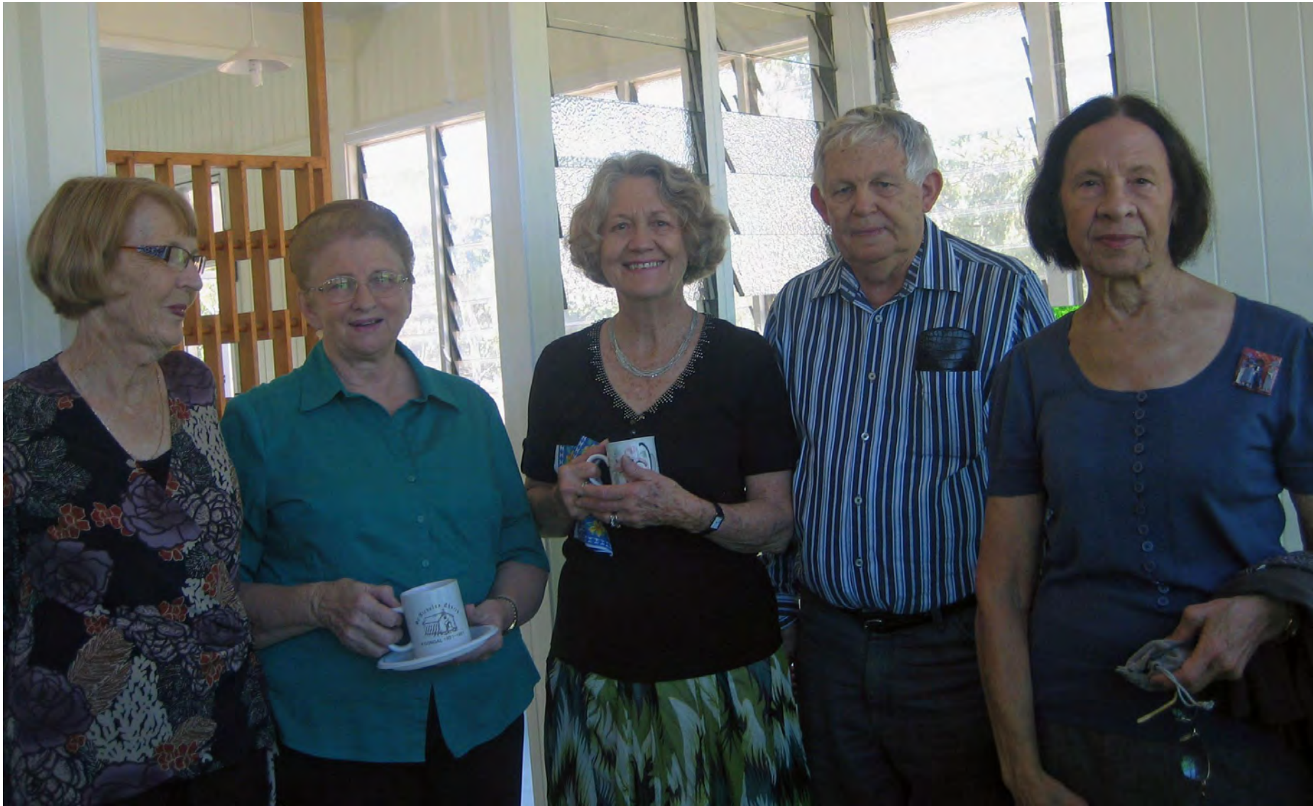
Celebrating Q150 at the ACHHA Museum June 2009