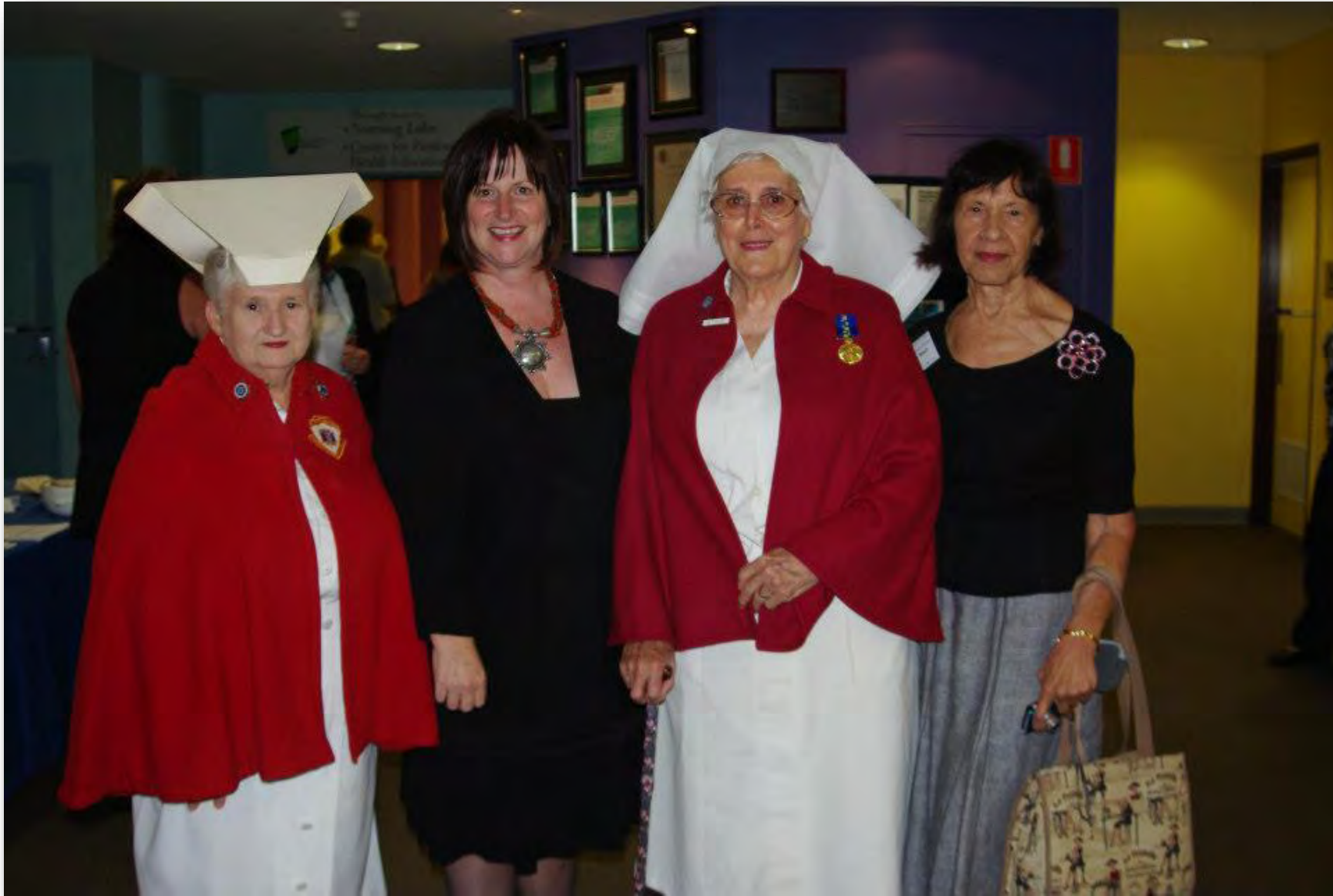
International Nurses Day 2015