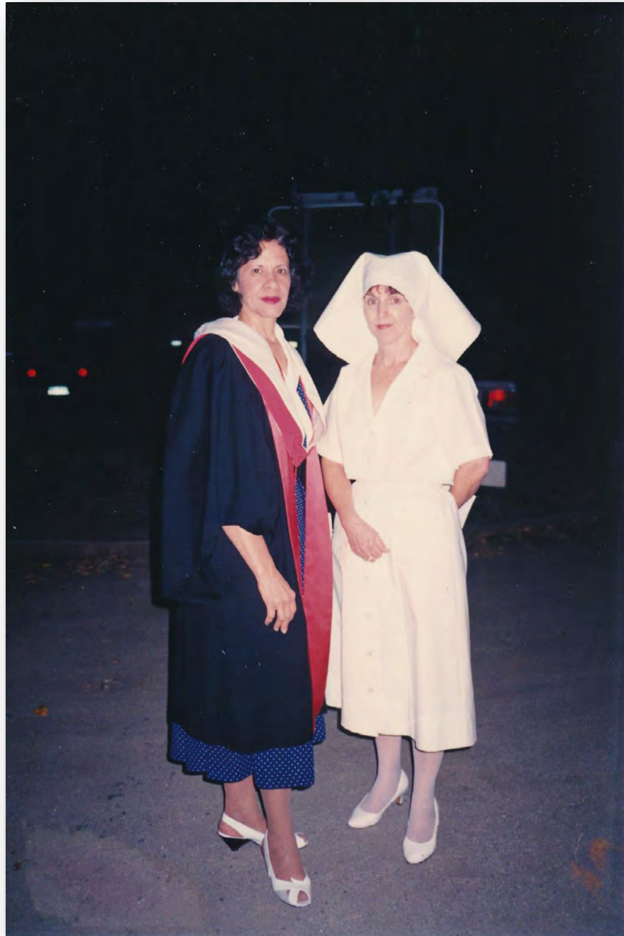
International Nurses Day 1988