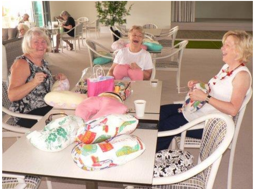
Having a cuppa and a good laugh at Breast Cushion Stuffing Day on Saturday

Due to many Zonta March commitments, the Service Committee did not meet this month, however, we still have been busy either planning projects or fulfilling our commitments.