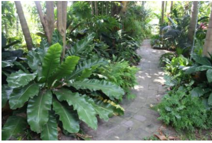
Norfolk Crows Nest Fern