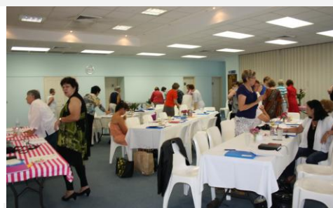
Enjoying the important part of any conference - Morning Tea. Time to catch up, meet new friends, and discuss topics.

As with all conferences the opportunity to listen to ideas from other clubs and bounce off ideas is the overriding theme. With our little group on the Sunday when we were all discussing ways of observing the important UN days supported by ZI, our group realised that we did not have a good understanding of what Human Rights are. We will cover this over the course of the year leading up to Human Rights day on 10 December.