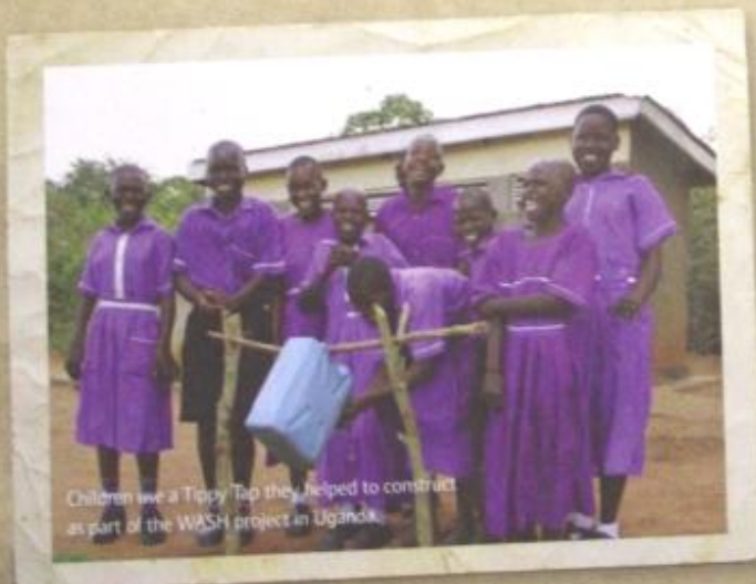
Children use a Tippy Tap they helped to construct as part of the WASH project in Uganda.