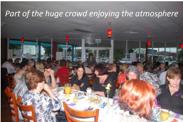
Part of the huge crowd enjoying the atmosphere