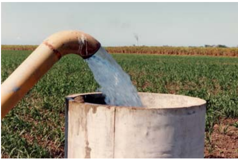
Water – the lifeblood (liquid gold) of our district. One of our Sugar Mills in the background