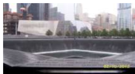
Figure 5 9/11 Memorial, NYC