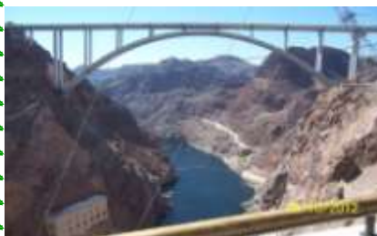
Figure 5 Hoover Dam

to Whistler, and Stanley Park. From Vancouver we caught the Rocky Mountaineer train to Calgary. The scenery during the two day train trip was magnificent. We were fortunate to sight some wildlife i.e. a black bear, elks, otter, reindeer, and ospreys. From Calgary we hired a car and drove to Lake Louise which is truly the most beautiful setting with the mountains, a glacier and the lake. It was a glorious day so there was much activity with hikers, mountain bike riders, a number of weddings, kayaking, and numerous tourists. From Calgary we flew to Toronto and visited the Canadian side of the Niagara Falls. Boarded the Maid of the Mist boat which takes passengers very close to the base of the Falls where you are able to hear the roar of the water and have some appreciation of the volume of water that is actually going over the falls. We travelled by train from Toronto to Quebec City. Quebec City is a very historical city where Old Quebec is within fortified walls erected during the battles between the English and the French. Most of the residents are bilingual where French is the first language.