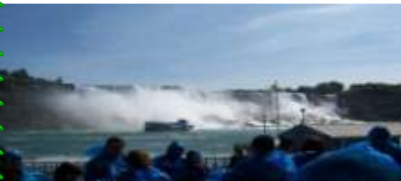
Figure 2 Maid of the Mist, Niagara Falls