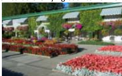
Figure 6 Butchart Gardens, BC