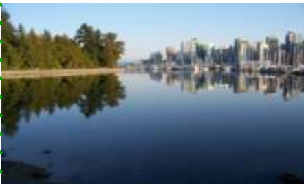
Figure 1 Vancouver City from Stanley Park

From Inez: Pat and I travelled to Canada and the States for almost four weeks from mid September. We flew from Townsville via Auckland, to Vancouver. We spent five days in Vancouver, visiting the Butchart Gardens on Victoria Island, took a day trip