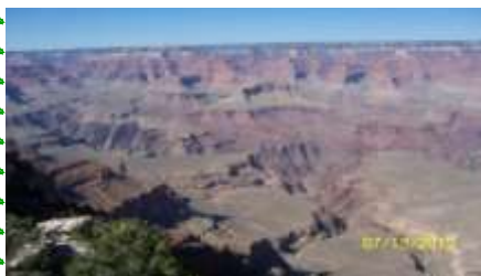
Figure 3 Grand Canyon