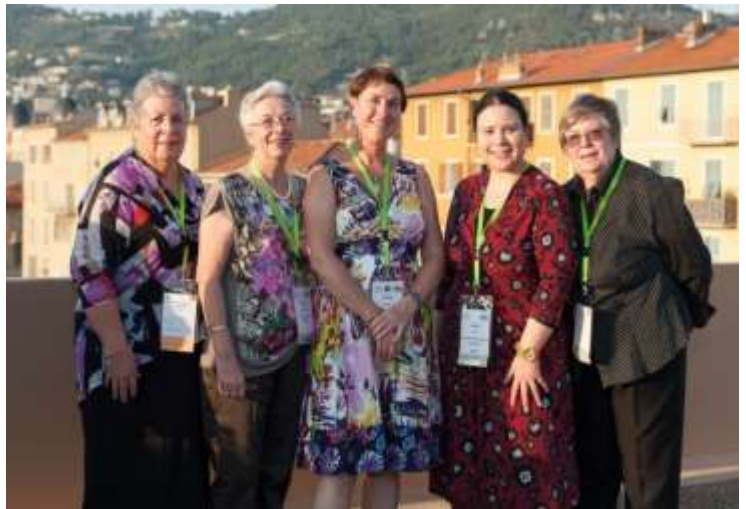
District 22 Delegates at Zonta International Foundation cocktail event