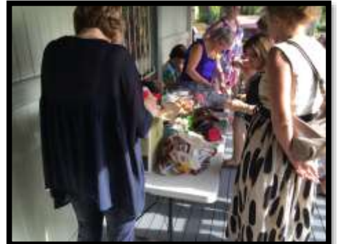
Fascinator making competition in full swing