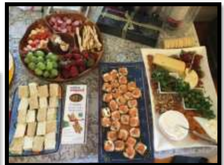
Delicious afternoon tea