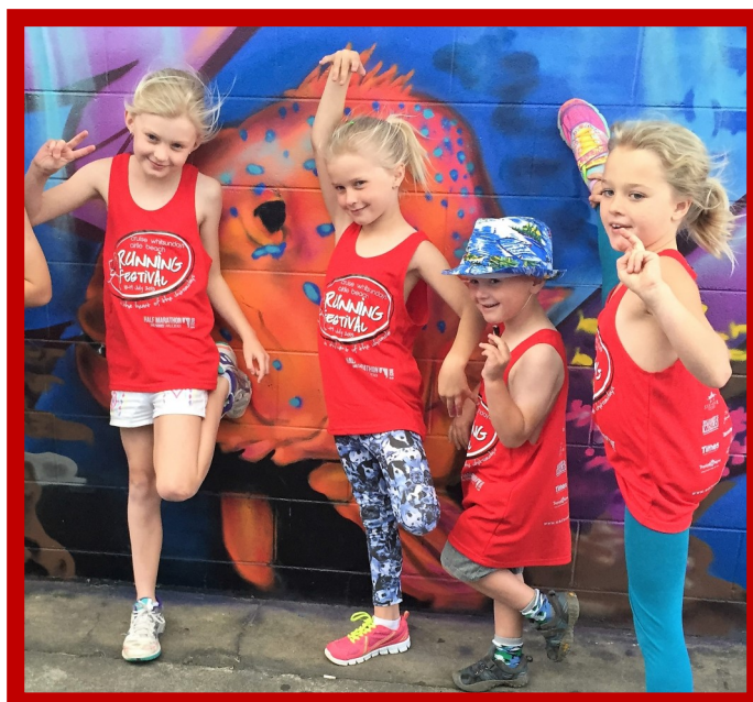
FUN FOR EVERYONE