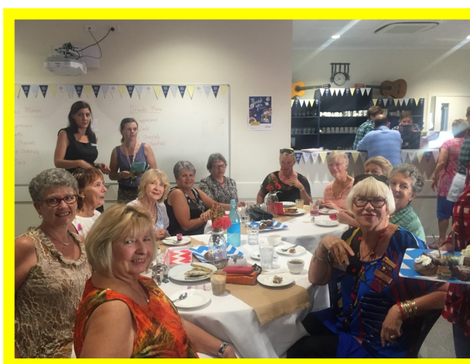
ST CATHERINES BIGGEST MORNING TEA