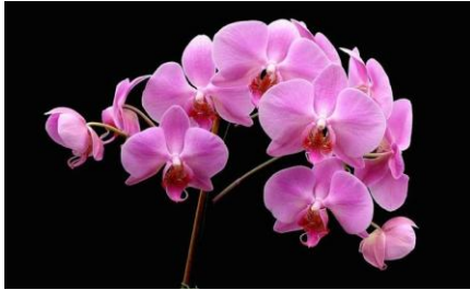
Cooktown Orchid – State Flower