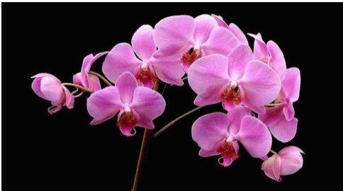
Cooktown Orchid – State Flower