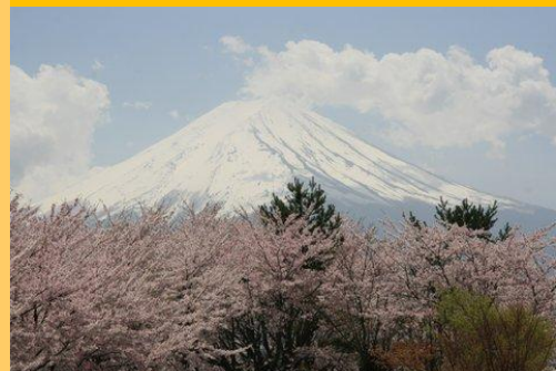
Mt Fuji and cherry blossoms