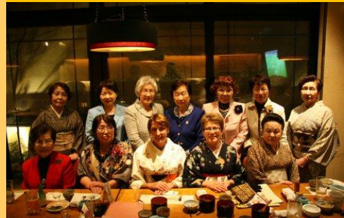
Members of Matsumoto club