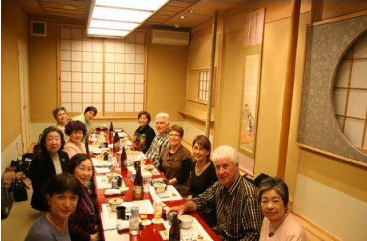
Members of the 3 clubs in Kyoto