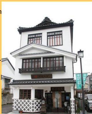
Ryokan - our accommodation in Matsumoto

I took samples of our birthing kits, mastectomy cushions and drainage bags to show all the clubs. One member from the Matsumoto club is the head of nursing at a local hospital and she was extremely interested, taking all the samples and templates I had taken to show them. Many of the members in both clubs had medical backgrounds.