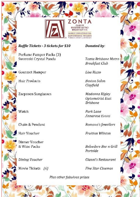
Zonta flyers on tables acknowledging our generous sponsors