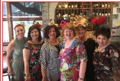
A bevvy of beauties