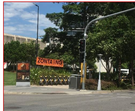
Our Banner displayed at South Brisbane TAFE

We also had our Zonta Says No Banner and two “orange women” displayed at South Brisbane TAFE during the 16 Days of Activism