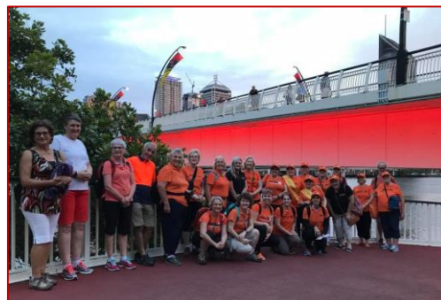
Under the Victoria Bridge