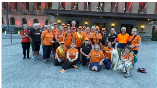
City hall clock is about to strike 6pm – and we are off!