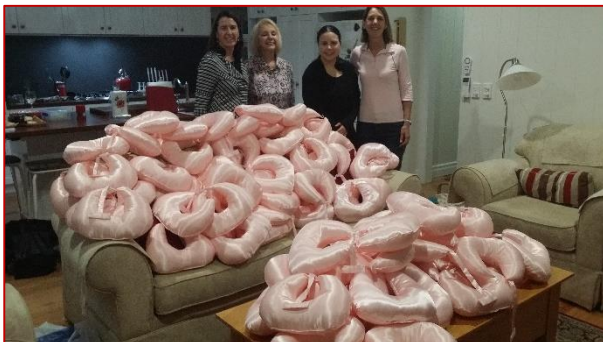
The finished product – 90 cushions