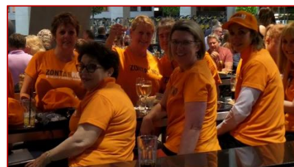
Relaxing at the Pig and Whistle