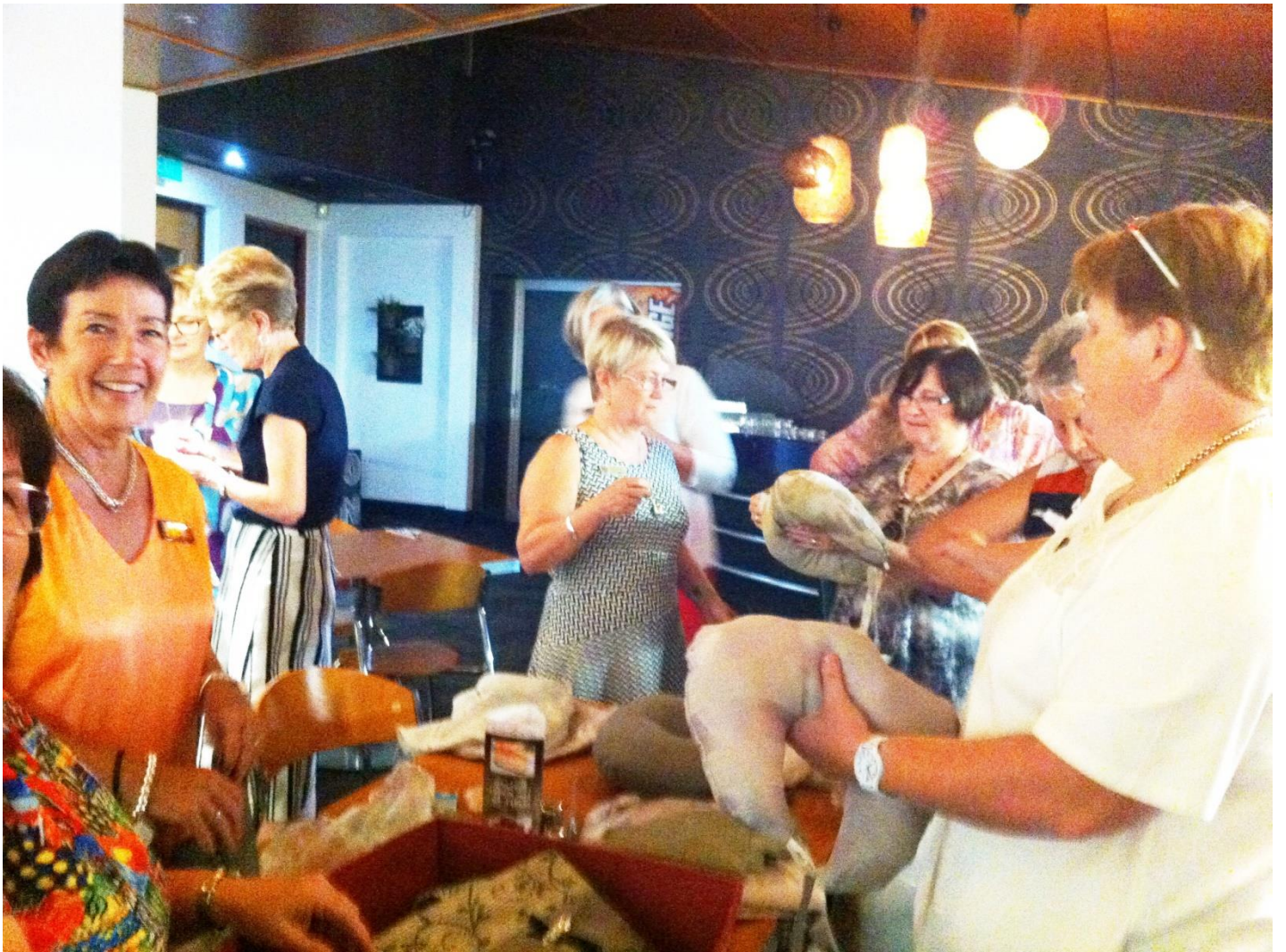
Lots of helpful people