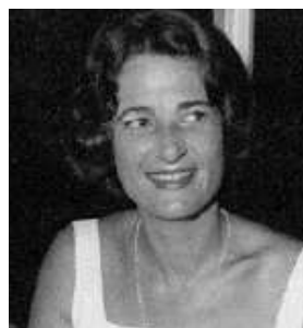
Vale Geraldine Pistorius