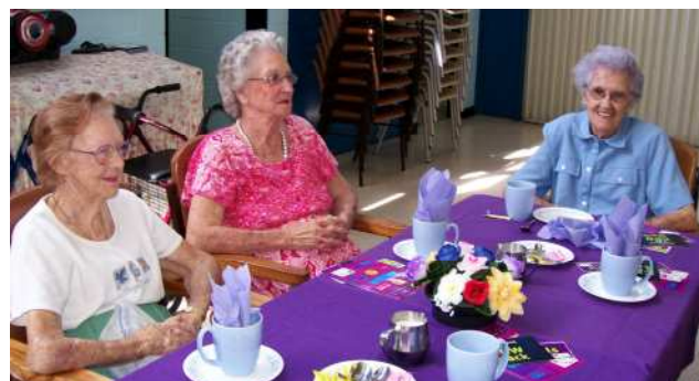
Residents and guests enjoying the presentation and music