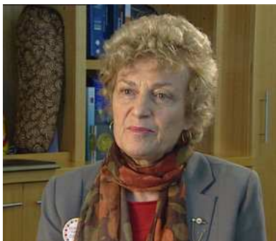
Advocate for the health of Australia's Children

Professor Fiona Stanley is passionate about the health of Australian children. She has established a number of research programs which focuses on prevention and social causes of children's diseases. Fiona is a professor at the School of Paediatrics and Child Health at the University of WA.