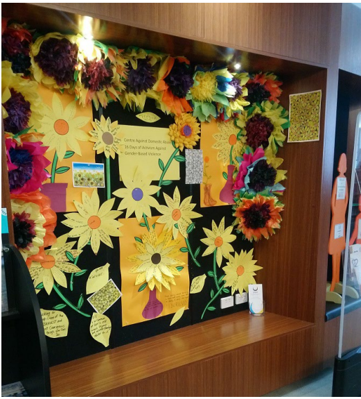
16 Days of Activism display