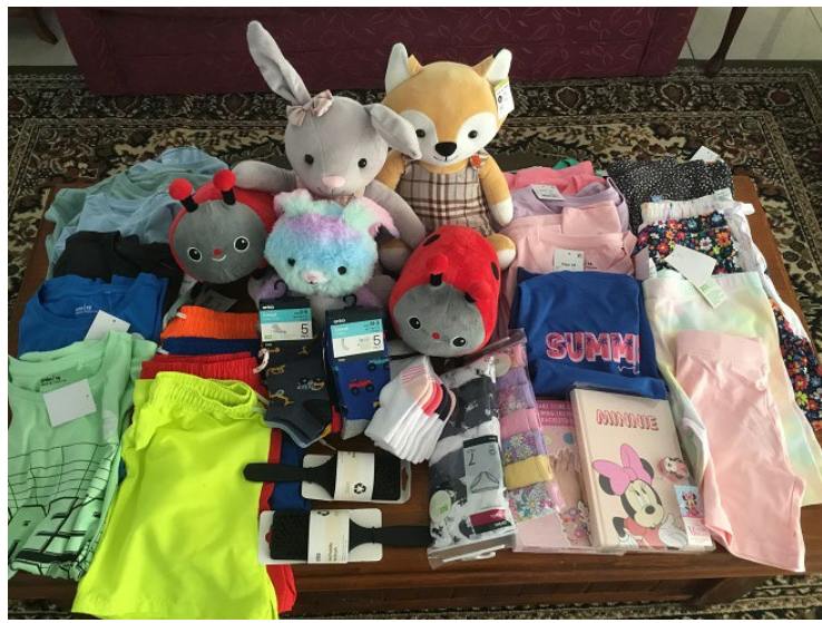
Toys and clothes donated to Buddy Bags