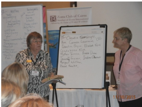
Dr Marilyn Waring (right) at a Sunday workshop - Qualities of woman leaders