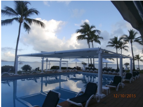
The venue Airlie Beach